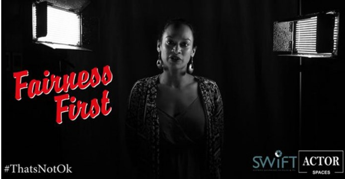
Screengrab from the #ThatsNotOK PSA.

Focus was back on the film industry last week, with Roman Polanski negating the importance of the #MeToo movement, branding it 'mass hysteria', and one of SA's directors called out on sexual misconduct allegations. Pledge to stand with Sisters Working in Film and TV (Swift)'s #ThatsNotOK.