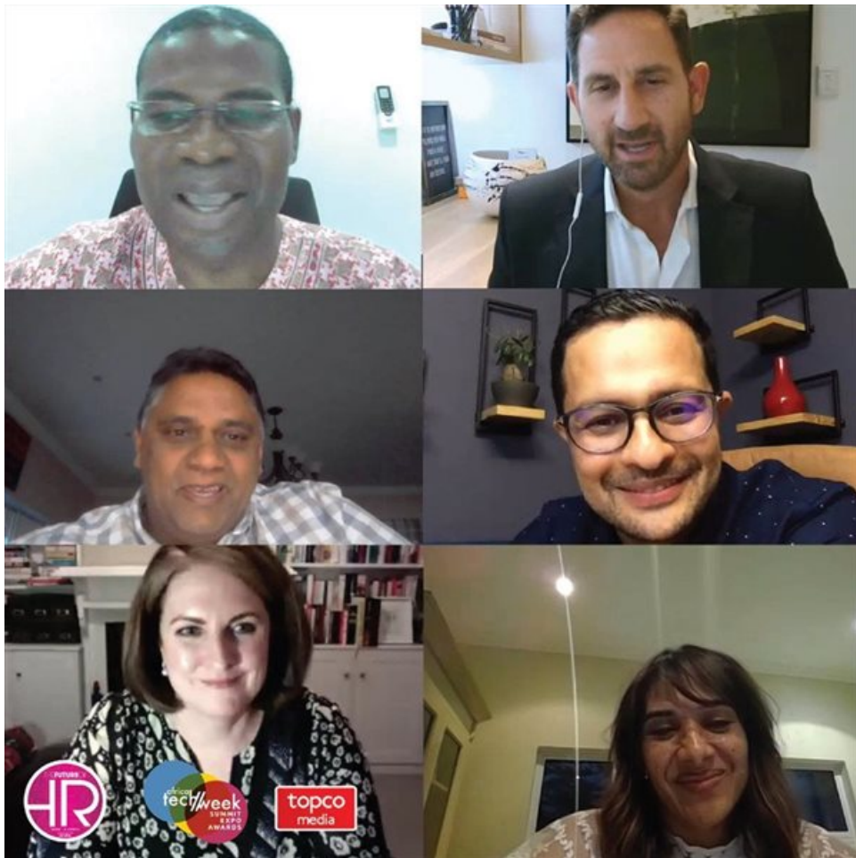
Some of the 2020 Africa Tech Week & Future of HR award winners