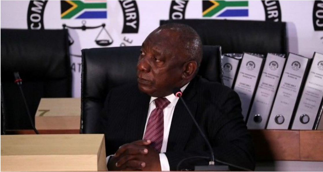
South African President Cyril Ramaphosa appears to testify before the Zondo Commission of Inquiry into State Capture in Johannesburg, South Africa, August 11, 2021.

Acting chief justice and chairperson of the commission of inquiry into state capture Raymond Zondo says he cannot wait to conclude the report of the three-year investigation and hand it over to President Cyril Ramaphosa. This as day two of Ramaphosa's testimony drew to a close on Thursday, 12 August 2021.