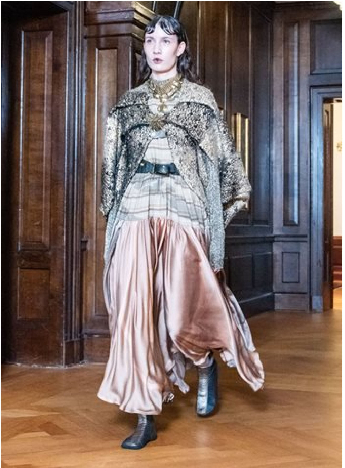
'Karoo Land of Thirst' by Viviers Studio. Source: Supplied