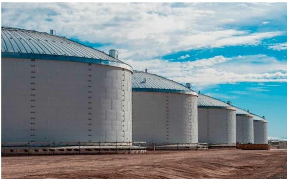
Molten salt tanks for thermal energy storage in a concentrate solar power plant. Abengoa

Pumped thermal electricity storage has a higher energy density than pumped hydro dams (it can store more energy in a given volume). For example, ten times more electricity can be recovered from 1kg of water stored at 100°C, compared to 1kg of water stored at a height of 500 metres in a pumped hydro plant. This means that less space is required for a given amount of energy stored, so the environmental footprint of the plant is smaller.