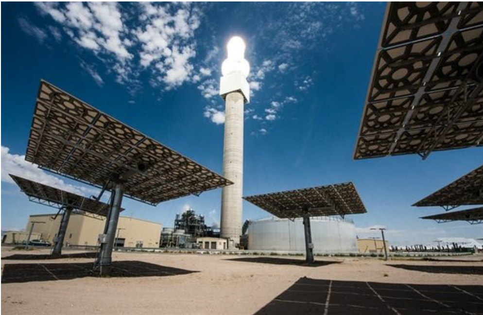
A concentrated solar power plant. National Renewable Energy Lab . CC BY-NC-ND