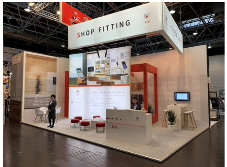
Lighting: Lightboxes creating vibrant graphics.

As touched on in the lighting trends, energy efficiency is on the rise and was especially evident in retail applications like low-energy refrigeration.