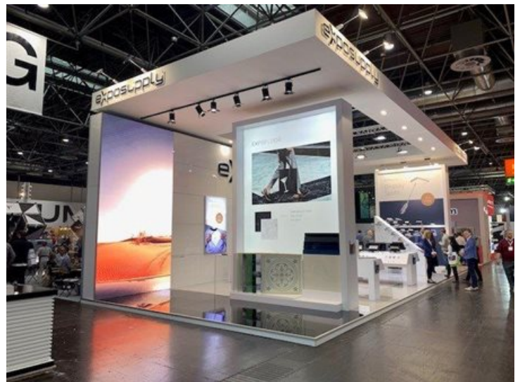
Digital innovation: More screens than walls.

Holograms and projections offer another way to create moving and changing visual displays. And just as LED screens are going onto all kinds of surfaces, so too are projections – onto floors, mesh fabrics, Perspex and other transparent materials, all of which creates interesting effects and textures.