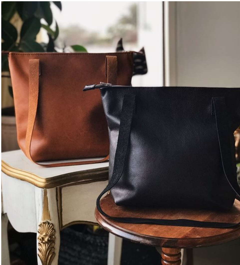
The Everyday Totes in Tan and Black

All of our products are handcrafted from 100% genuine leather. We currently have 13 different designs/bags each and every bag has no gender assigned to it so we appeal to all types of different people, making our products all inclusive.