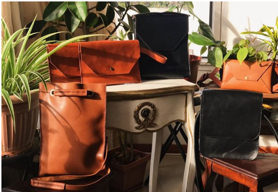
L to R Sling Tote in Chocolate, Clutch in Tan, Mini Briefcase in Black, Envelope Crossbody in tan and Messenger Bag in Black.