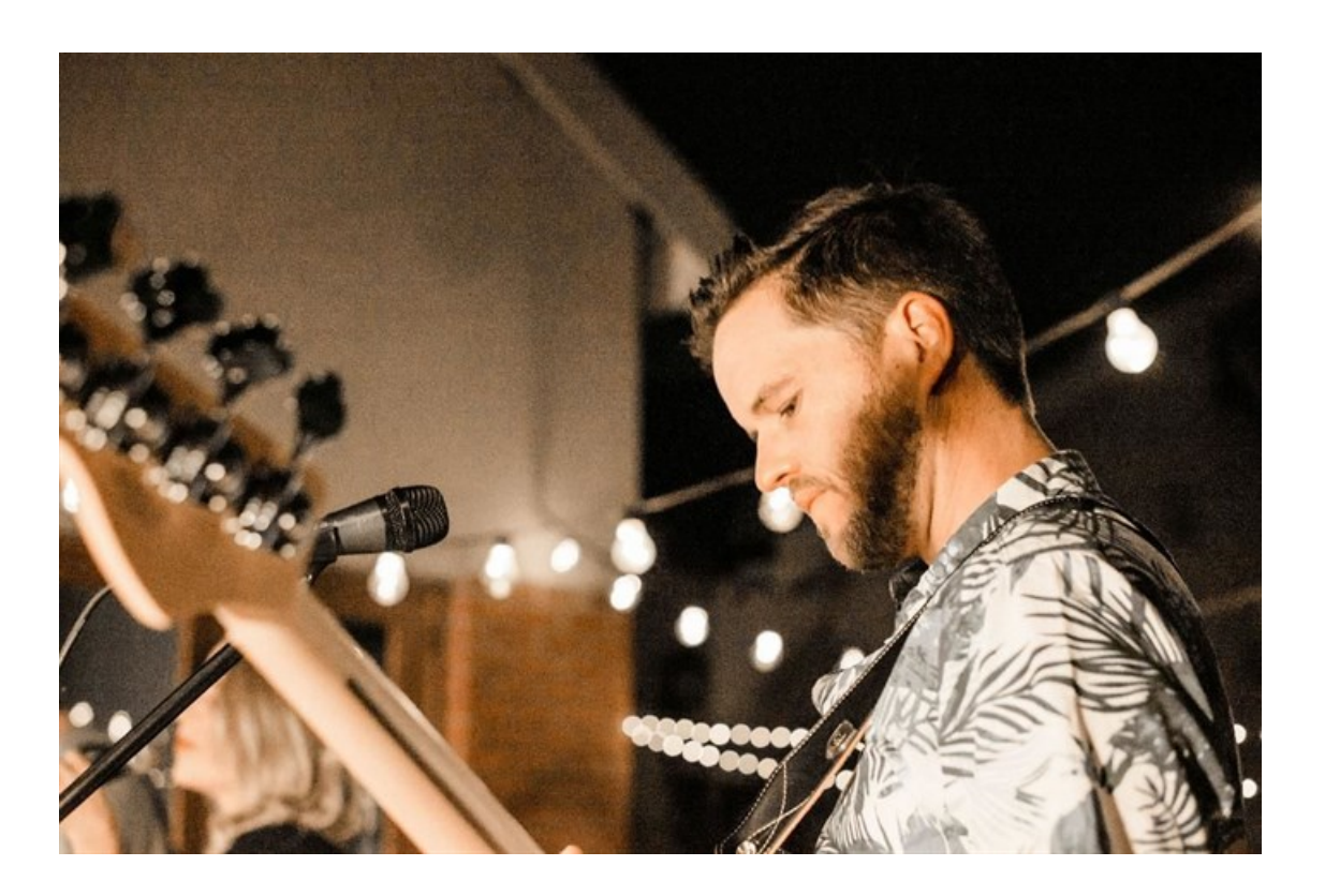
## What does music mean to you?