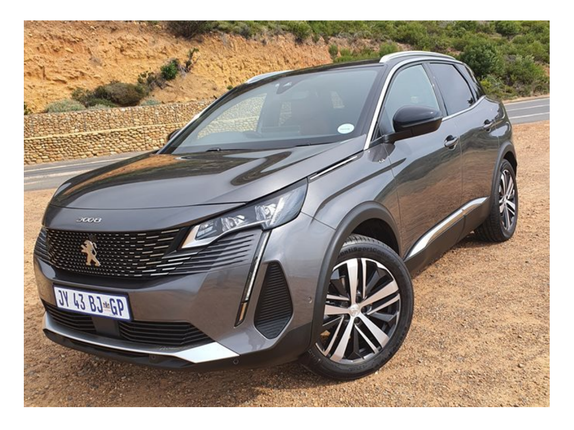
Full LED headlamps on the GT offer a high-tech, distinctive look, creating an extended light signature further optimised by the bend lighting function (EVS), which enhances visibility at speeds of up to 90km/h.

There is a specific grille on the GT model with a scalable design pattern to emphasise the stylistic upgrade of this version. The front headlamps have also been redesigned to be more aggressive and include LED technology extended by hookshaped Daytime Running Lights (DRLs) with chrome tips – a light signature perfectly in line with current Peugeot style and identifiable at first glance.