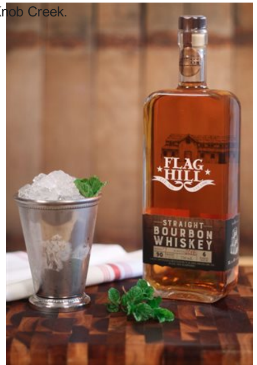
Flag Hill - Bourbon

For recipes Follow @usdistilledspiritssa on Instagram and @USwhiskeyZA on Facebook.