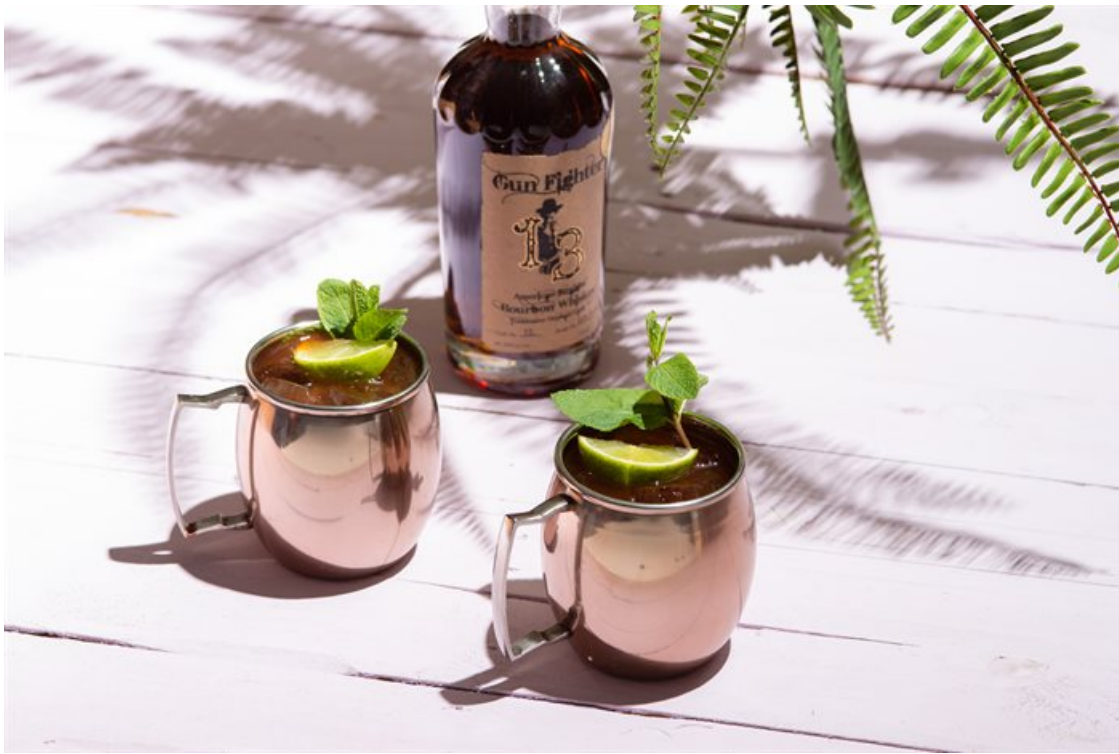
Gunfighter Golden Moon

The Gun Fighter American Double Cask Bourbon is described by Gould as having a unique smoothness and complexity coupled with a rye spiciness.