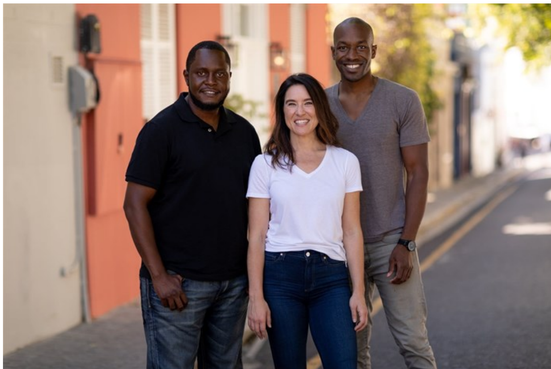
Carry1st's co-founders