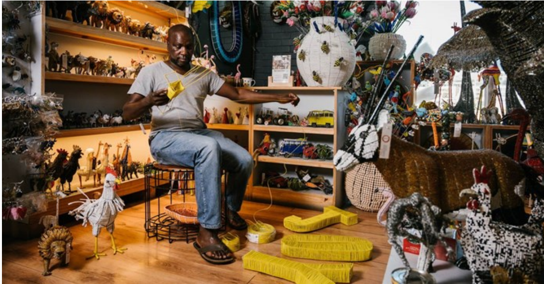
The V&A Waterfront Joy From Africa To The World is returning this year

The V&A Waterfront is once again partnering with local artists and crafters to present a visual spectacle of installations in the festive season.