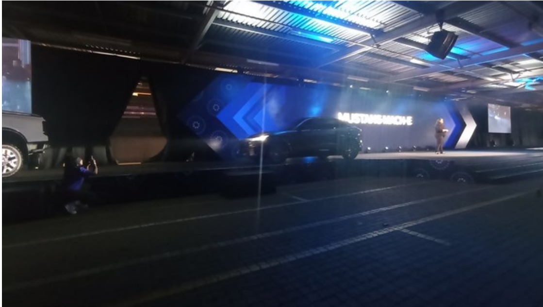
A blurred shot taken of the Mach-E showcased at the celebratory event

Ford will be introducing updated Tourneo and Transit Custom vans next year as well. The seventh-gen Mustang and the Mustang Dark Horse (the most powerful naturally aspirated 5l V8 Mustang ever, according to Ford) will also land on local shores in the coming year. A new Ford SUV will also be making its way to South Africa in 2024, this is the Ford Territory SUV, which will come with a turbocharged 1.8l four-cylinder engine.