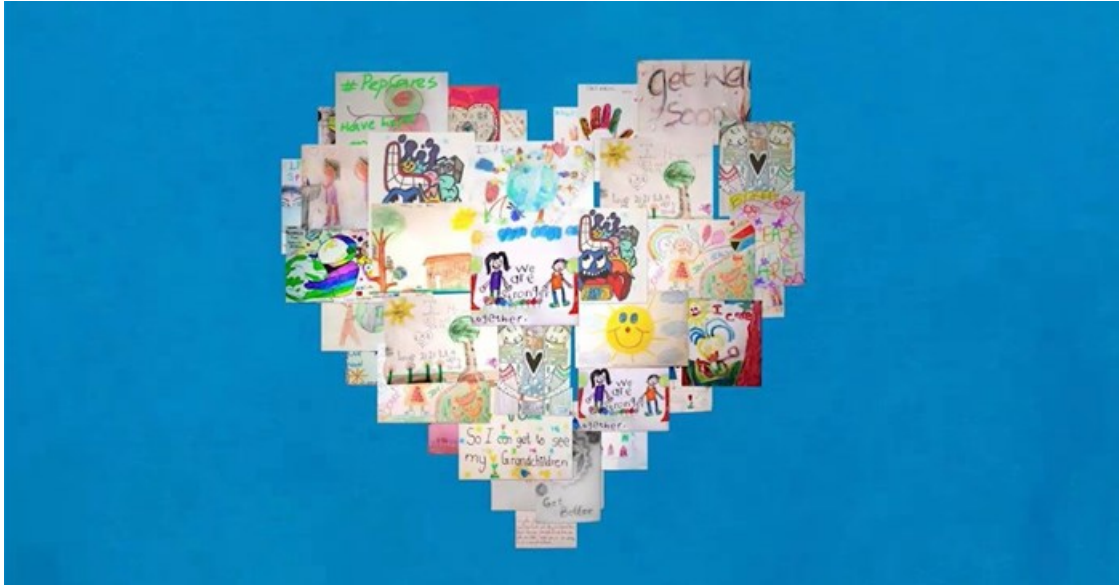
Image from Pep ad on Youtube .

The Covid-19 coronavirus pandemic has transformed brand communication and necessitated great changes in advertising. Some smart brands in South Africa and across the globe have found intelligent ways to remain top of mind with their audiences by showing a more caring and engaging side rather than hard sell marketing messaging.