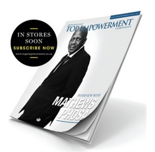
click to enlarge