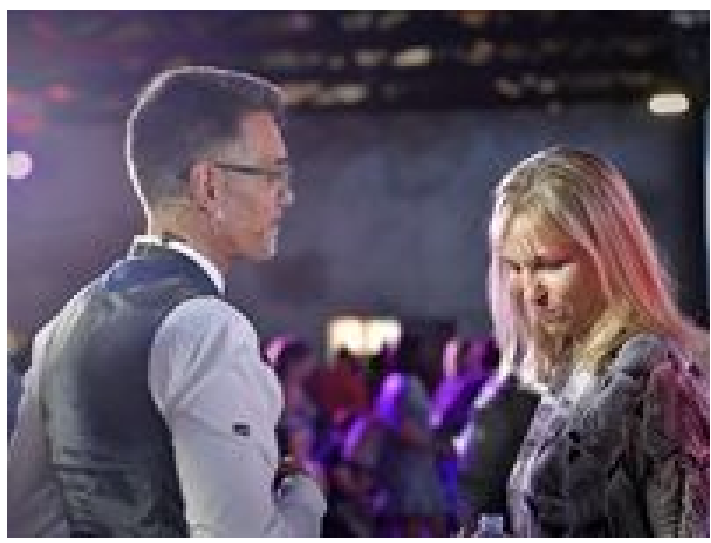
For more, visit: https://www.bizcommunity.com