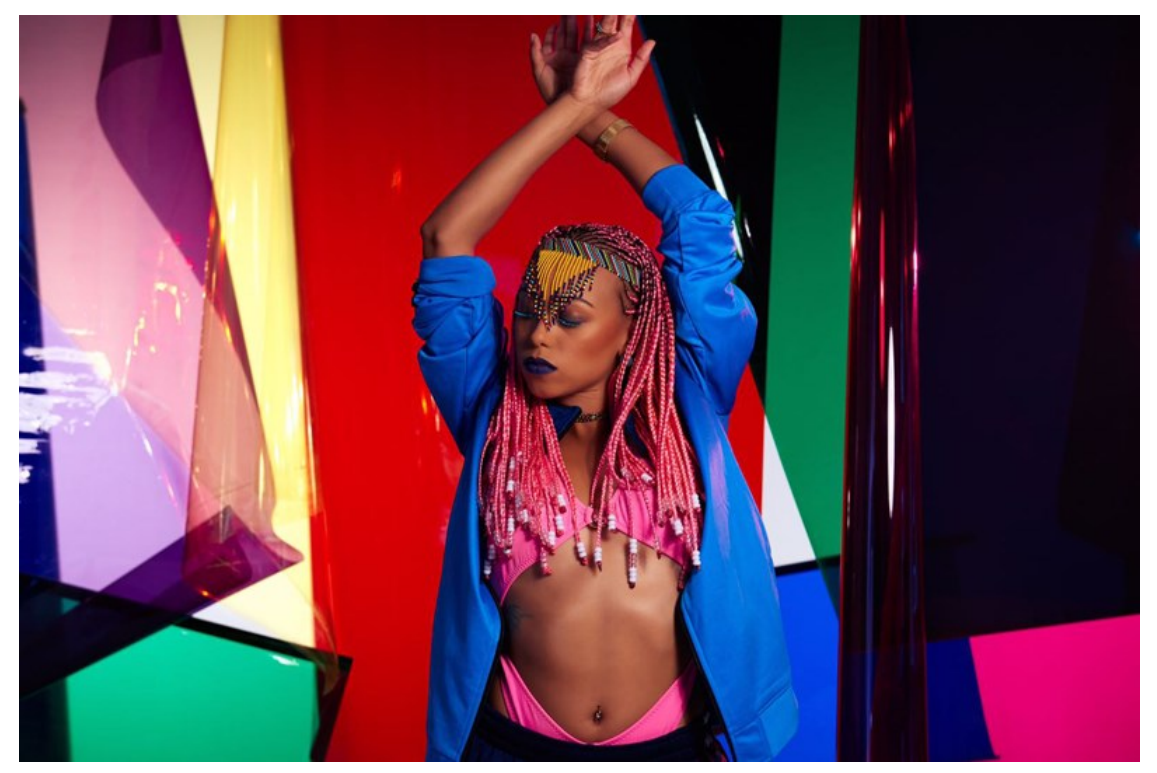
DJ Doow ap

Coinciding with Women's Month, festival goers will be entertained by some of the hottest female acts in SA, including Moozlie; Rouge; and DJ Doowap, supported by DJ Capital; and Beatsampras.