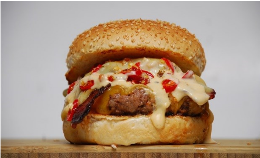
The Chilli Cheez Bomb burger.

With beef, chicken and veg smash burger patty options all served on breadboards, the burgers are juicy, saucy and spill-licious, also dubbed “the most Instagrammed in South Africa”. The shoestring fries are served piping hot in a metal basket and even better when ‘turbo-charged’ – that’s Rocomamas-speak for topping them with more super-hot chili cheese or a milder, super-tasty chili con carne. The best part is that a meal here will hardly break the bank, with the freak shakes and adult shakes both R50, regular shakes at R35 and only the ribs over R100 on the food menu.