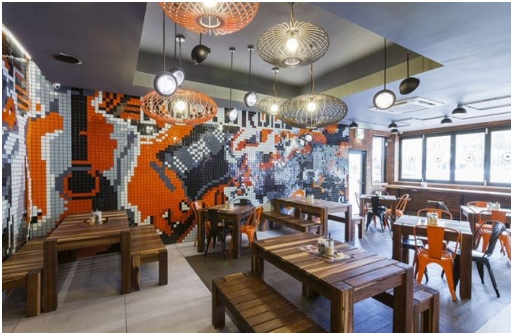
Rocomamas' seating area.