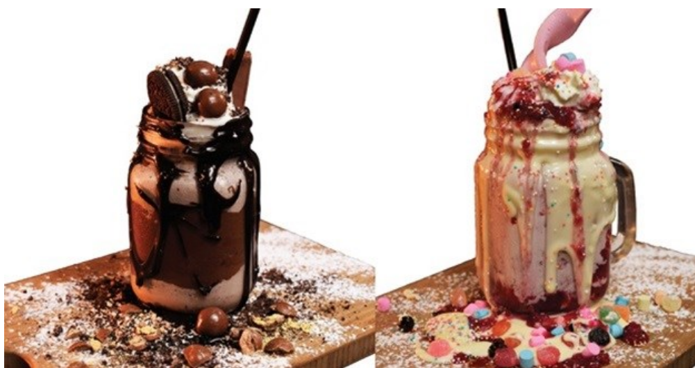
The Jackie Brown/slow death by chocolate and Cindy/Candylicious freak shakes.

I went with two of the specials advertised on the table – first, the Instagram-must ‘candylicious’ freak shake. It’s a swirly pink concoction in a Consol mug just brimming with whipped cream, hundreds and thousands, a twist of pink Fizzer and swirls of berry syrup. It’s also dotted with berry-flavoured Jelly Tots and dripping melted white chocolate down the side of the glass, both inside and out, just asking to be licked up with a finger. It got a few admiring glances on its way to our table, as did the neighbouring table’s chocolate version, the aptly named ‘slow death by chocolate’ – there’s also a ‘peanutology’ version, brimming with peanut butter, malted chocolate balls and more.