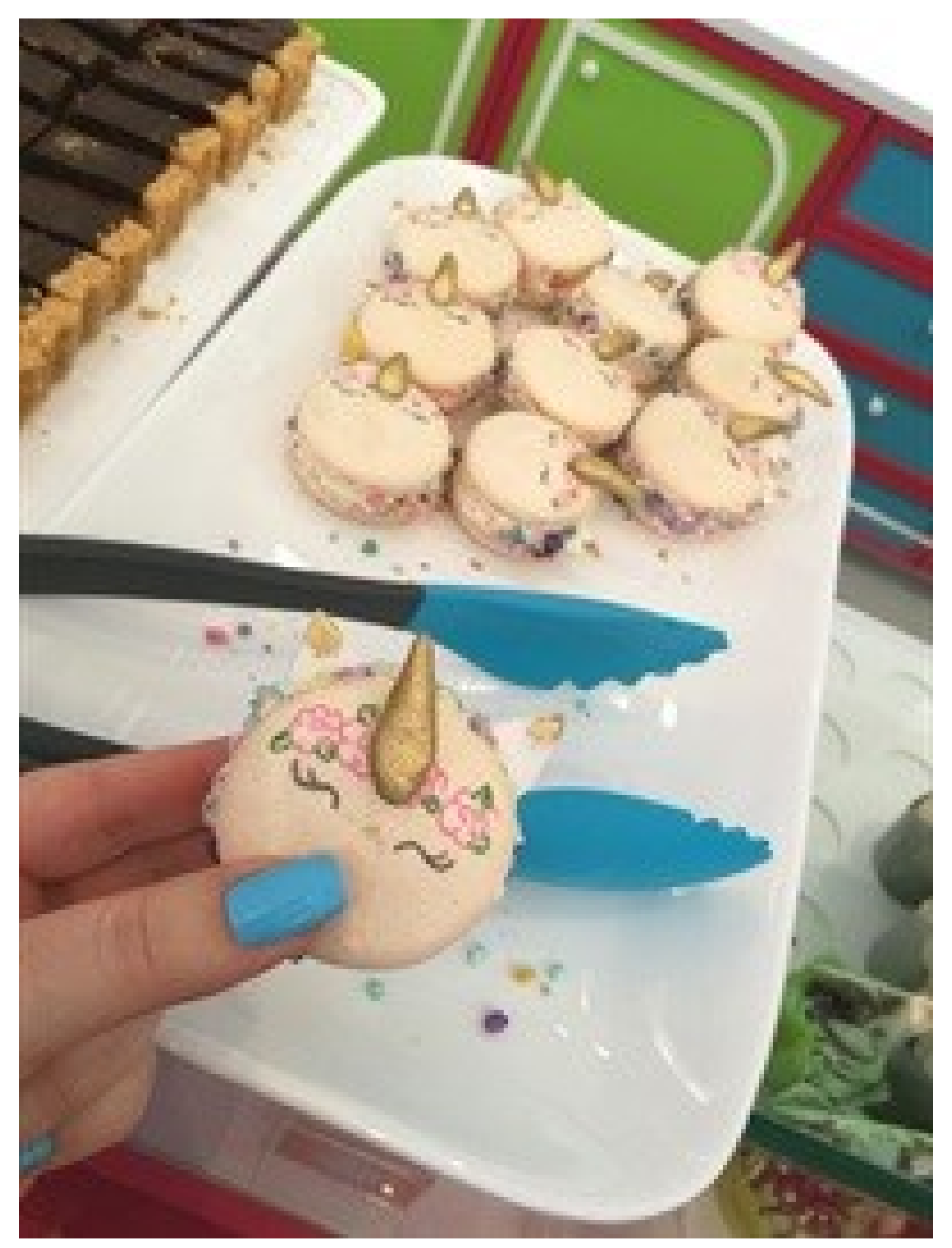
click to enlarge