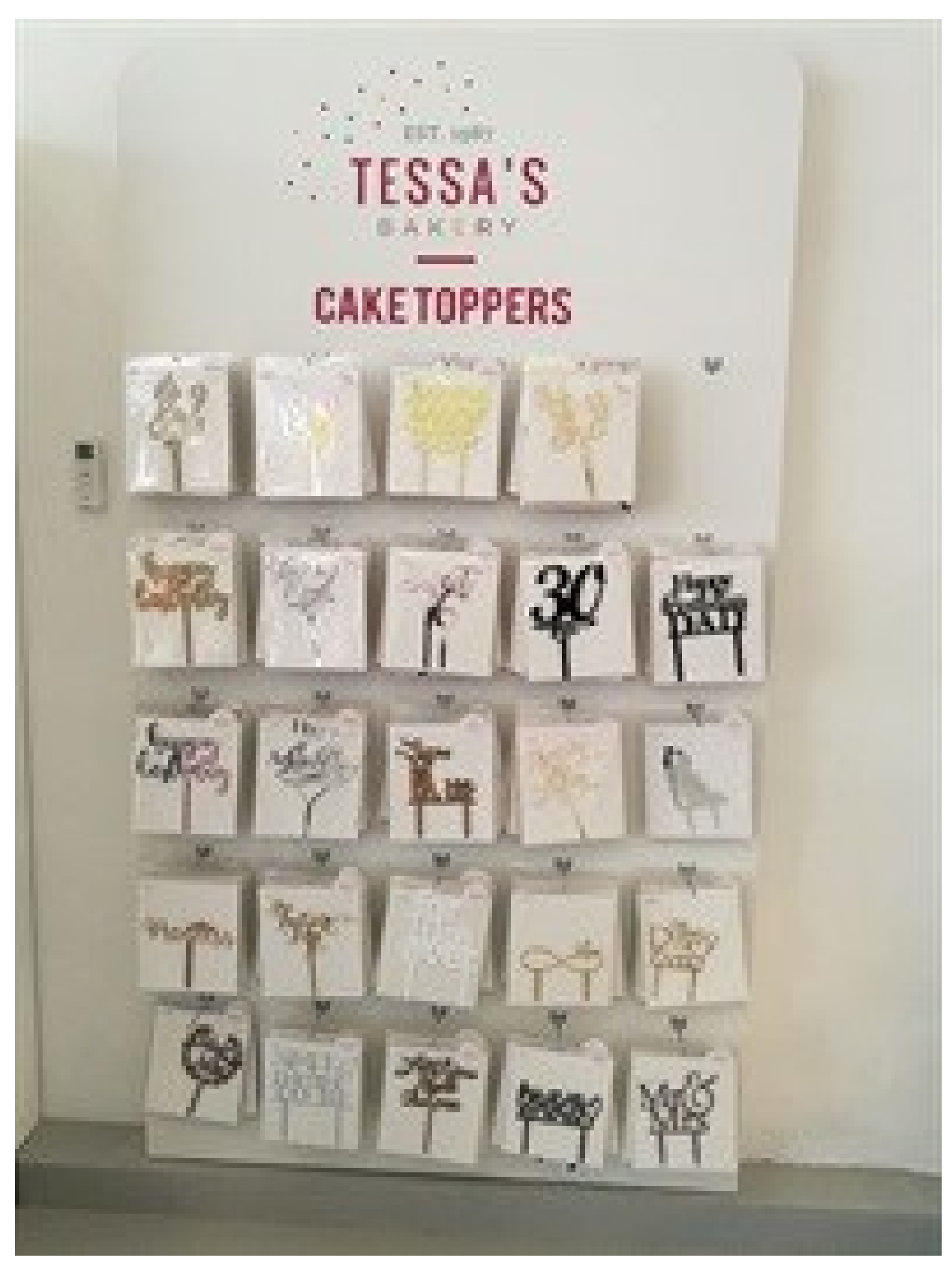
click to enlarge