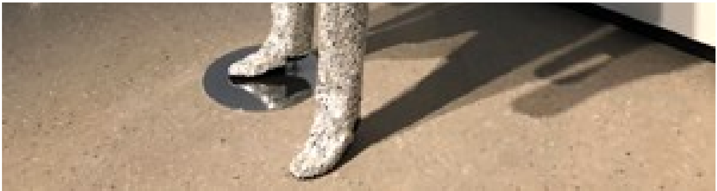
Nick Cave, Soundsuit, 2012