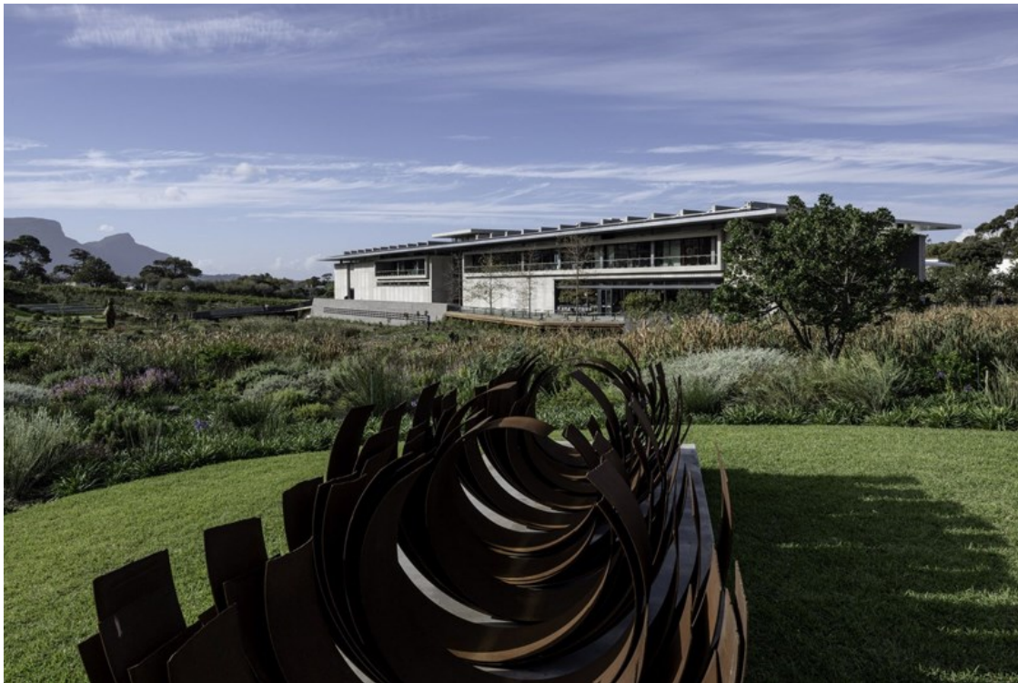
Norval Foundation sculpture garden

The recently opened Norval Foundation in the Cape Town suburb of Steenberg offers a proud, new public resource and new levels of excellence in the curation and display of South African and African visual art.