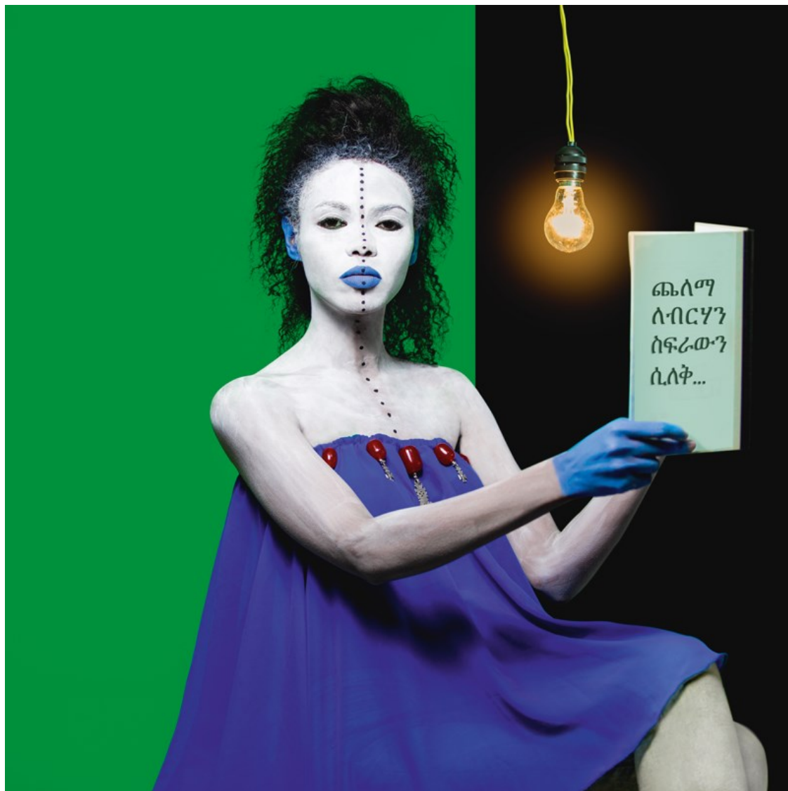
Aida Muluneh - Darkness Give Way to Light

The gallery will present 54 unique artworks, each created by an artist from a different African country, under the theme of “The Light of Africa”.