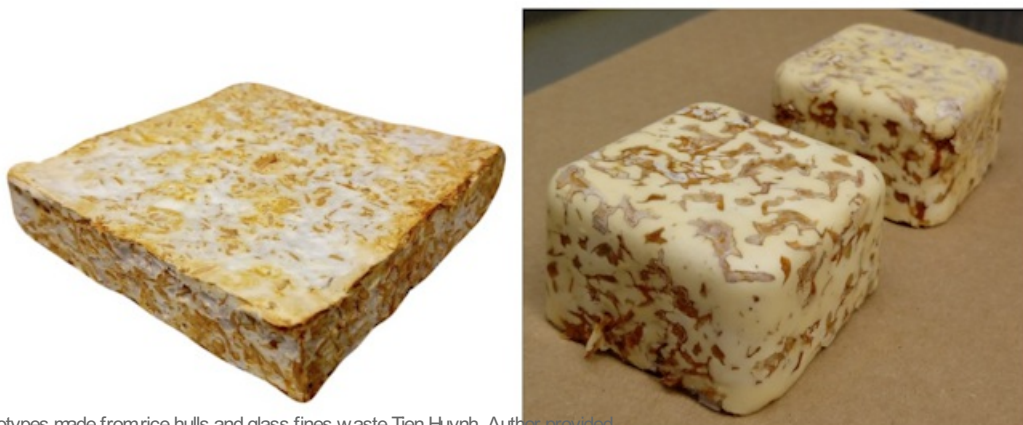
Fungal brick prototypes made from rice hulls and glass fines waste.

Working with our colleagues , we used fungus to bind rice hulls (the thin covering that protects rice grains) and glass fines (discarded, small or contaminated glass). We then baked the mixture to produce a new, natural building material.