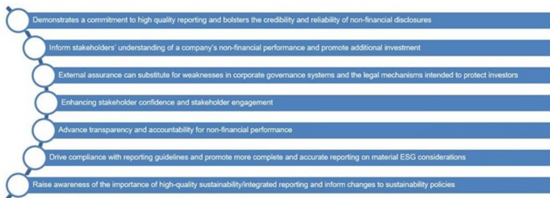
Figure 3: Impact of external assurance on report quality

Additional guidance should be provided on making an integrated or a sustainability report the subject matter of an assurance engagement in its entirety. The assurance of only some parts of these reports is already contributing positively to their quality. A broader approach to assurance which covers more categories of information, the controls used to safeguard the reliability of data and the methods used to compile a report will be of even greater value to stakeholders.