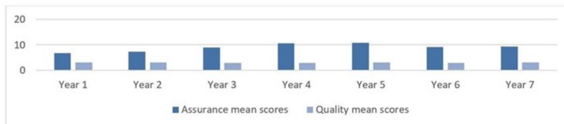
Figure 2: Mean assurance and quality scores of 42 firms over a seven-year period

When assessing the inputs in Figure 1, the academic research finds that the use of an assurance provider enhances the stakeholder's confidence in the quality of a report. Moreover, the use of a Big 4 firm is associated with an increase in both the ESG assurance and IR quality mean scores. Interestingly, the impact of reasonable versus limited assurance had a negligible effect on assurance and quality mean scores. This is likely due to the perspective of non-experts who may interpret these opinions in a similar manner.