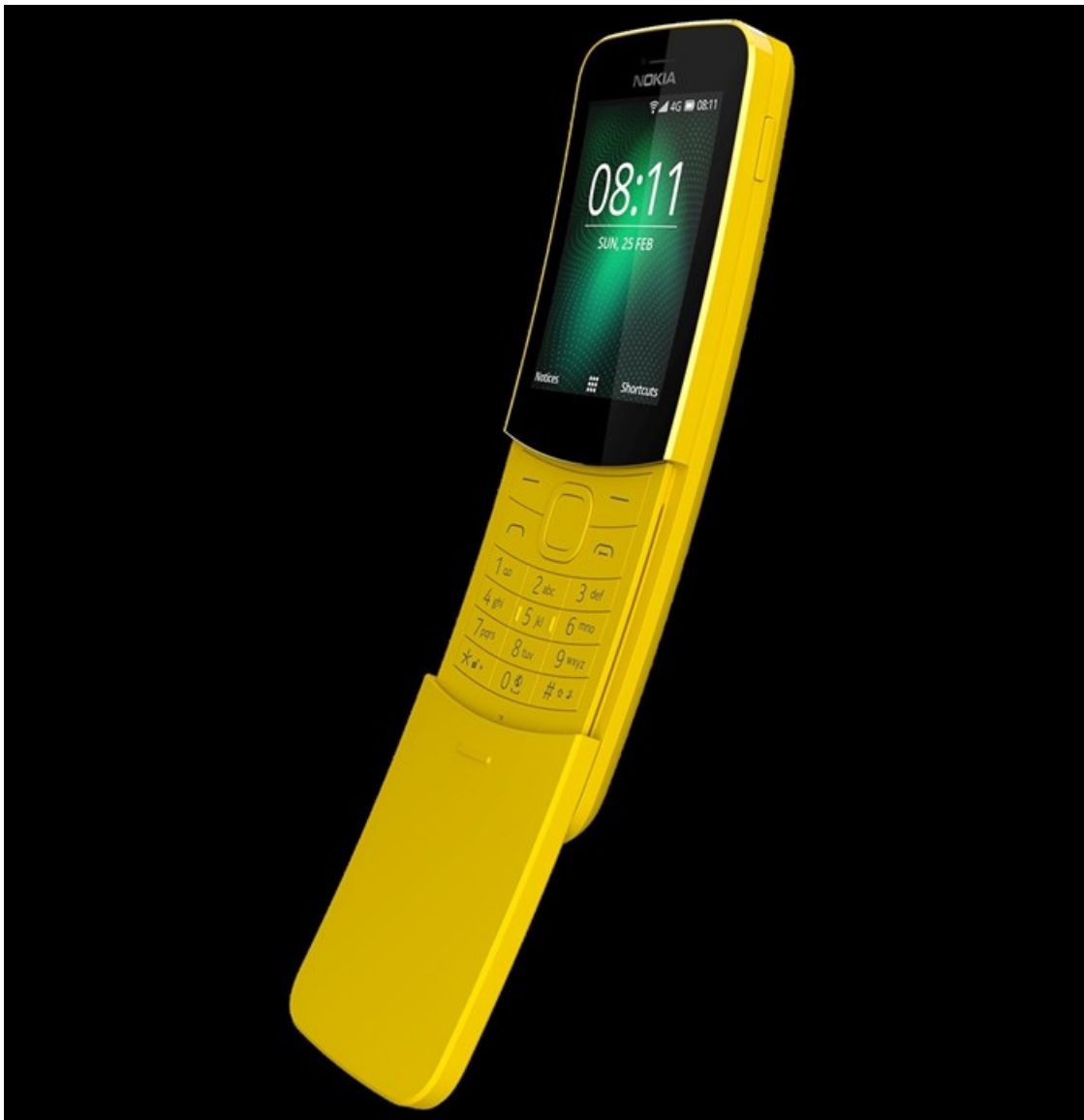
Nokia 8110 4G

"The feature phone market is also a very important stepping stone for us to entry-level and affordable smartphones. We firmly believe that being entrenched in this number one position in terms of value in feature phones, positions us for the next decision that gets made by a significant portion of the population to upgrade to an entry-level smartphone. This is the really exciting part of the Nokia 1," he says.