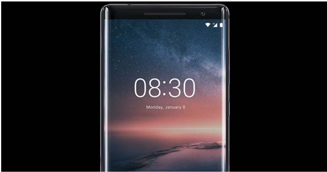
Nokia 8 Sirocco

Its curved glass finish, envelops a precision-crafted stainless-steel frame to deliver a fusion of strength and beauty. Just 2mm thin at the edge, it combines a curved edge-to-edge pOLED 2K 5.5-inch display with smaller bezels and moulded body curves to create an ultra-compact profile.