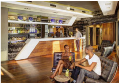
Fancy a tippie with a view?