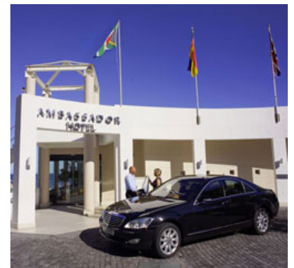
And it all begins here.

In the last six months, the Ambassador has expanded its reach and accessed new markets. In May alone occupancy was 27% year-on-year while conferencing revenue is up 10% each month for the same period.