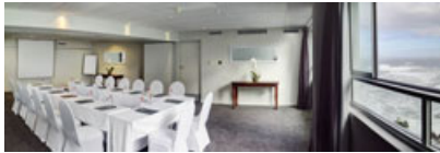
...Or a conference with a view - though the question has to be asked: How will you keep everyone's attention on business at hand?

We had pre-meeting drinks at Salt Vodka Bar on the opposite side of the road where the Ambassador Suites are. With its James Bond's Dr No interior, black Mies van der Rohe Barcelona Chairs, granite counters and a balcony primed for sundowners, this is a smart space that will get sexy after dark. The ground floor deli, to be called Voila, is being transformed into a casual eatery but was still under construction when we visited.