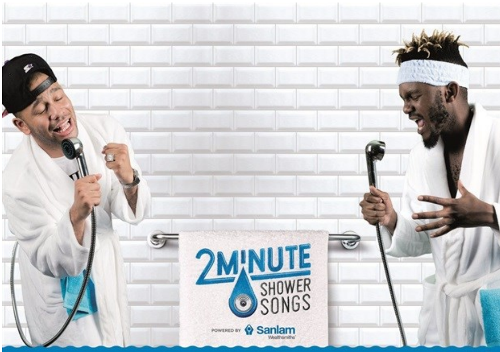
2-Minute Shower Songs.

Five different Sanlam campaigns won 17 awards, including a Grand Prix and four Golds. Of course, Sanlam Two-minute Showers was our main winner on the night, but this wasn't a clean sweep by a one-off stroke of magic.