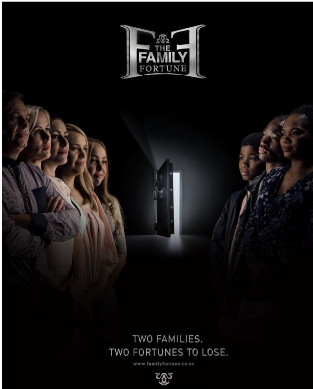
The Family Fortune.

King: I'm not going to dare to presume the health of another agency's relationship with its client, but I do respect a marketer that doesn't change their agency every four years because of a procurement mandate.