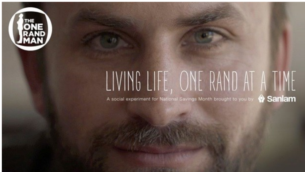
One Rand Man.

This might sound obvious, but it's crazy how many marketers are afraid to put a foot wrong. Innovative work, by its very nature, requires trying something new, taking a chance here and there, and Sanlam has always had that eagerness to go where other brands haven't gone in a creative sense.