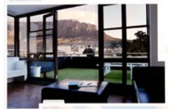
Grand Prix winner - FoxP2's Offices in the Communication Design Three Dimensional and Environmental Design - Architecture and Interior Design category

This new award, in partnership with Sappi, considers all paper-based entries. The winner of The Creative Use of Paper Award was The Motel for Humanoid's corporate ID.