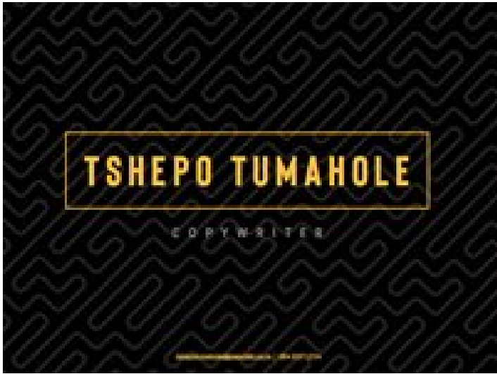
Young Creatives - Tshepo Tumahole

For more, visit: https://www.bizcommunity.com