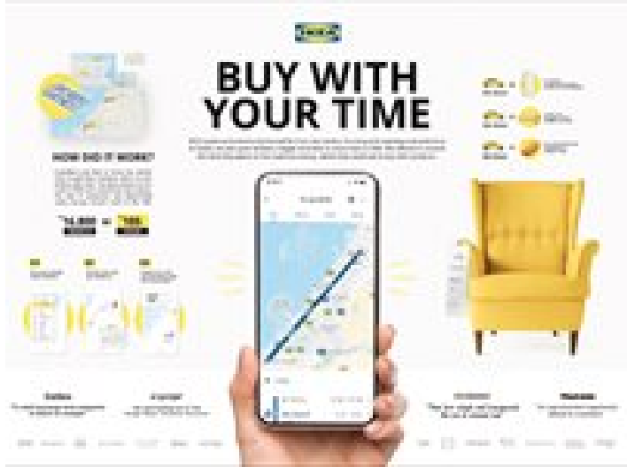
Media Innovation - Silver