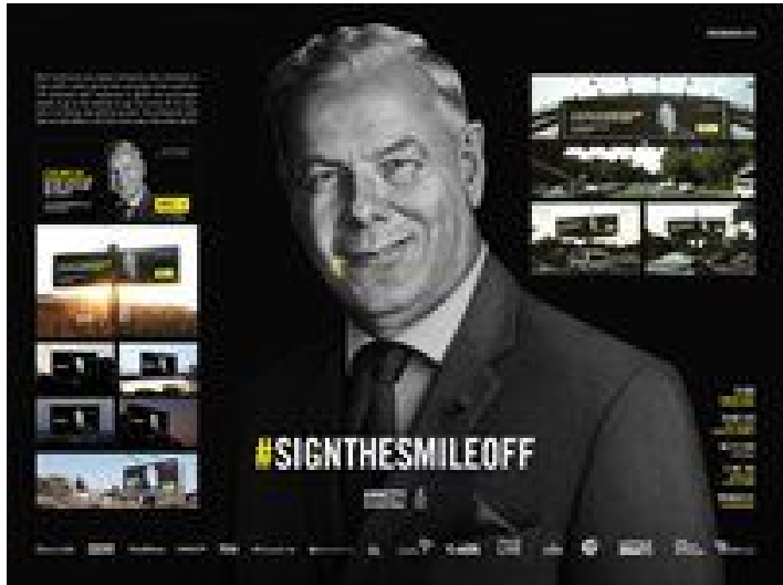
Integrated Campaign - Bronze