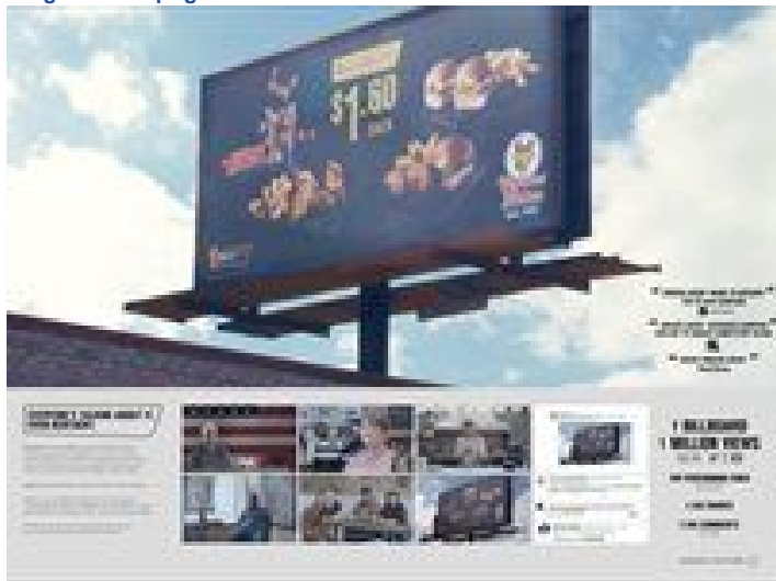
Integrated Campaign - Silver