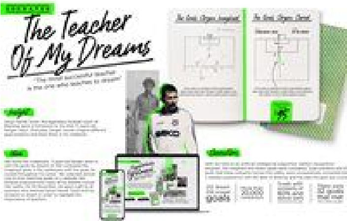
Digital Crafts - Craft Certificate