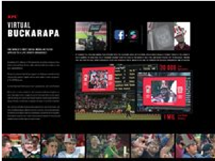
Media Innovation - Bronze