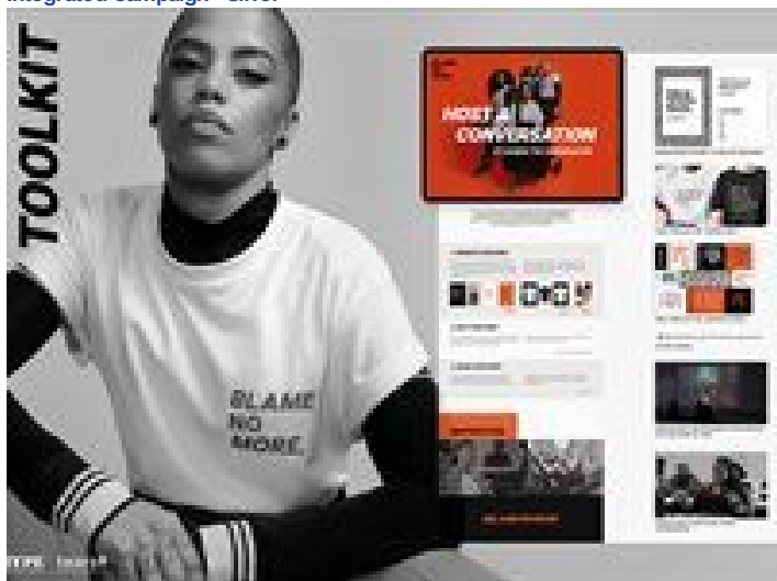
Integrated Campaign - Gold