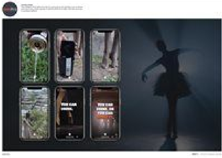
Student Instagram Challenge - Silver