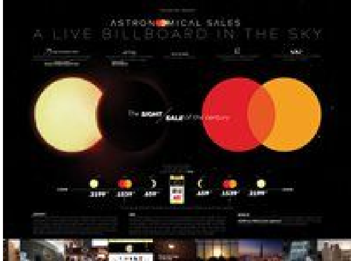
Media Innovation - Gold