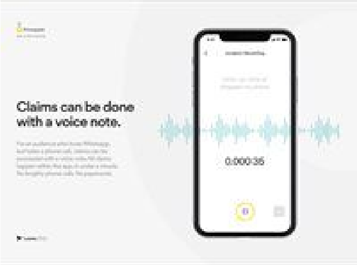
Digital Crafts - Craft Gold