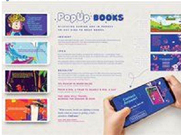
Digital Communication - Silver