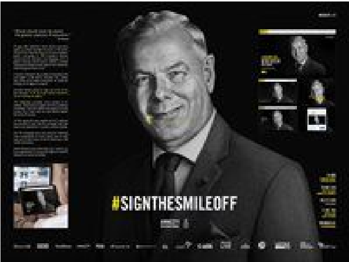
Digital Communication - Gold