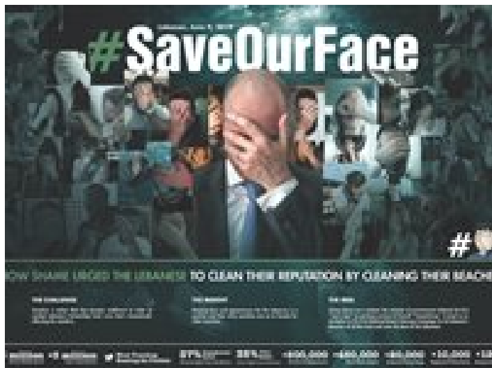
Digital Communication - Silver