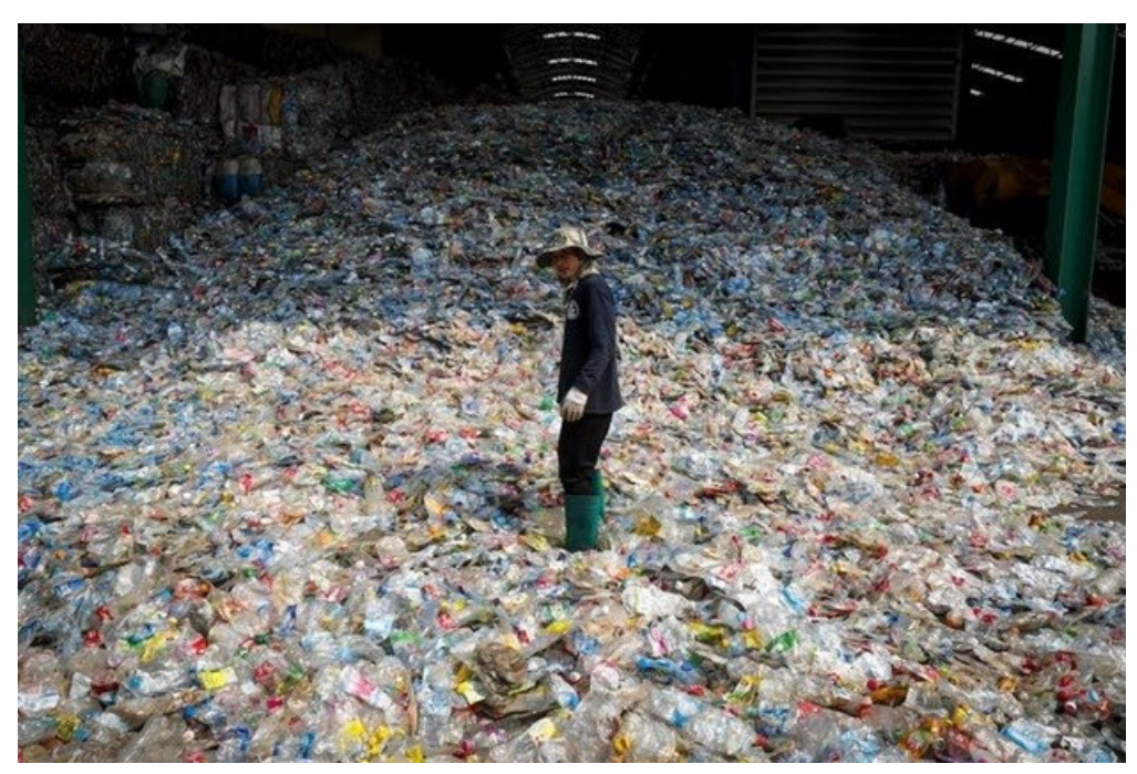
Sending our platic to Asia is not a solution.

With limited domestic recycling facilities, Australia and New Zealand are seeking new markets. Last year, New Zealand sent about 250,000 tonnes of plastic to landfill, and a further <u>6,300 tonnes to Malaysia for recycling</u>. But now <u>Malaysia</u> is also rejecting other countries' hazardous plastic waste.