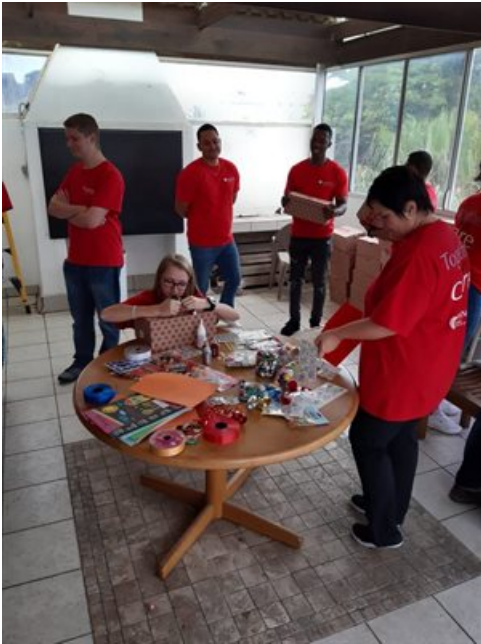
The PE team working on their personalised boxes for the Santa Shoebox Project