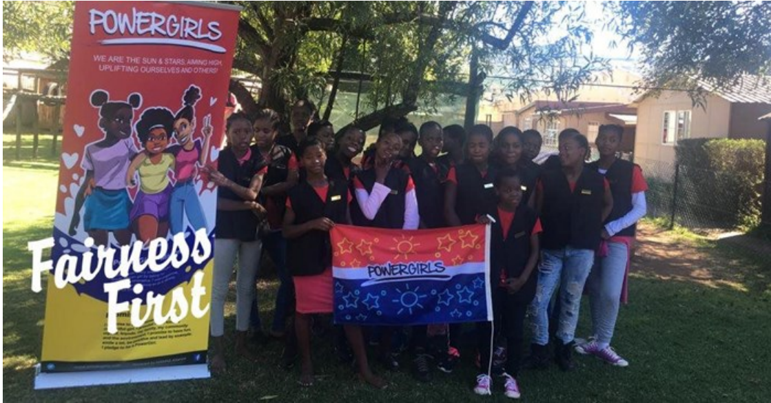
Mamas Alliance's PowerGirls.

With International Day of the Girl recently marked in celebrating the achievement of girls worldwide, we're putting the spotlight on the local PowerGirls seven-year programme, which aims to transform vulnerable South African girls into outspoken and powerful young women, capable of becoming change agents within their communities.