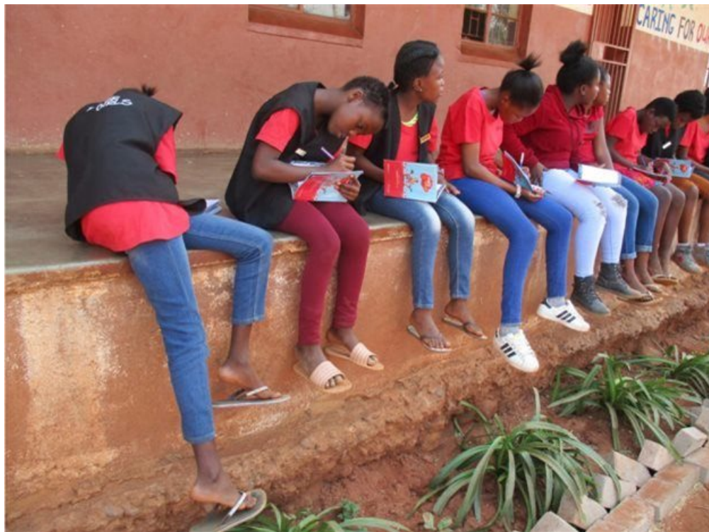
Mamas Alliance's PowerGirls.

PowerGirls is an initiative of Mamas Alliance, and at this stage is only for members of the Alliance. We have confirmed funding for the next three years, but growth of the programme beyond that will depend largely on how much funding we receive.