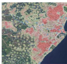
Heat map with Suburb Layer