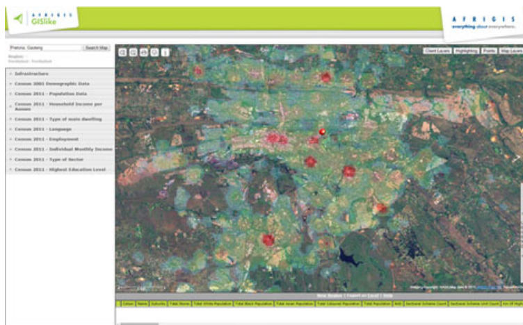
AfriGIS GISlike Interface

AfriGIS GISlike is an online mapping and analysis application that enables you to streamline your planning and operations by mapping your own data, together with extensive AfriGIS and Census datasets - therefore you can view and analyse your customer data on a map and then adjust or modify your trade areas or maintenance and sales strategies in context of Census and other AfriGIS datasets.