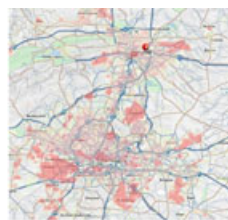
Population Density Heat map