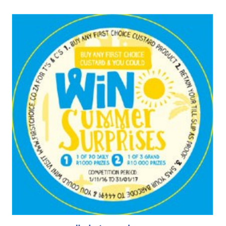
click to enlarge

Creatively, Boomtown wanted the campaign to have a summer look and feel, which is why the use of bright yellow can be seen with the contrast of blue. "We also wanted to give the custard packs a quirky personality, which can be seen through the use of speech bubbles." adds Jess Massyn who heads up the Woodlands/First Choice account at Boomtown.