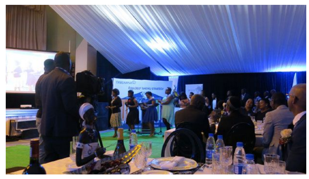
Members of the Jwaneng Mine Hospital Choir file in for a medley of wonderful harmony.

"Ladies and gentlemen, we are proud of our association with COHSASA, which has been instrumental in our quality improvement endeavours. To this end, Jwaneng Mine Hospital has embarked on a hospital expansion project which will reposition us as a healthcare facility comparable to any facility of its size, anywhere in the world," he said.