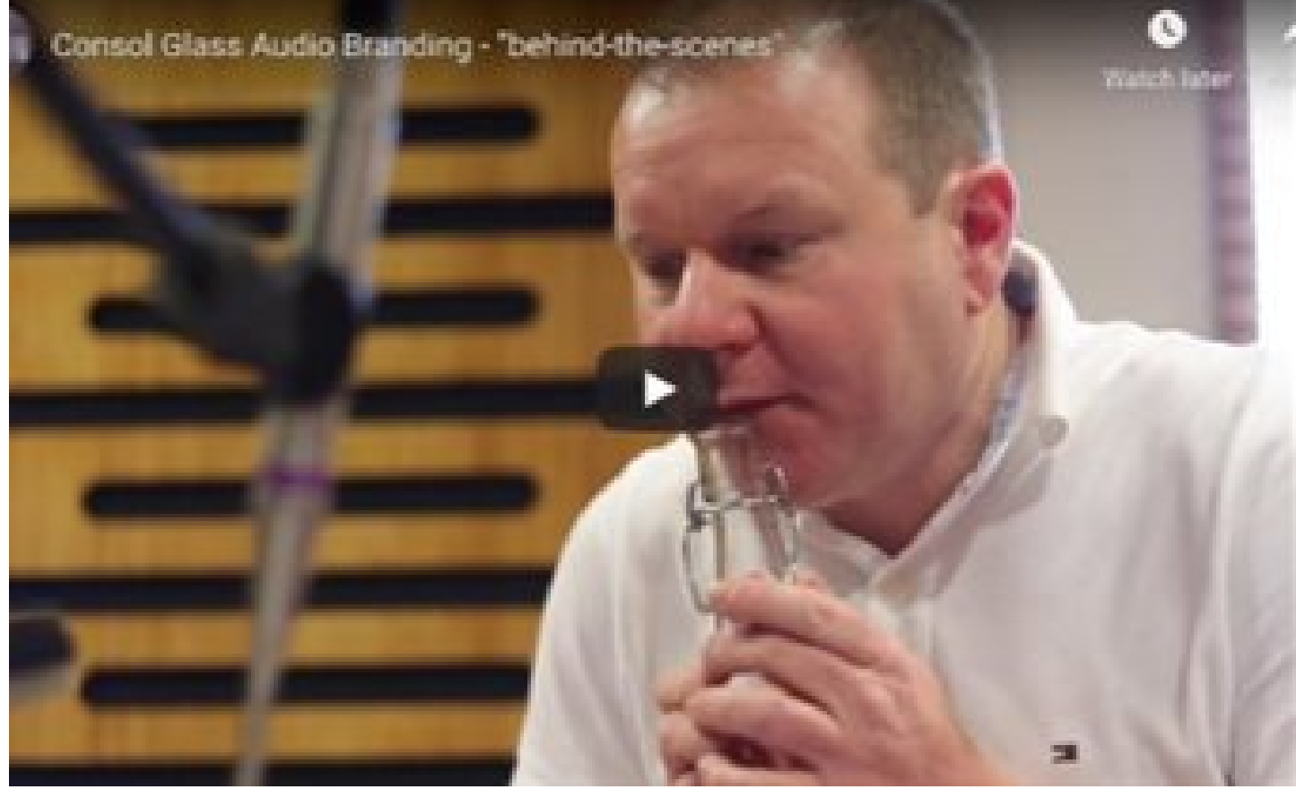
Check out the behind-the-scenes of the Consol Glass audio branding