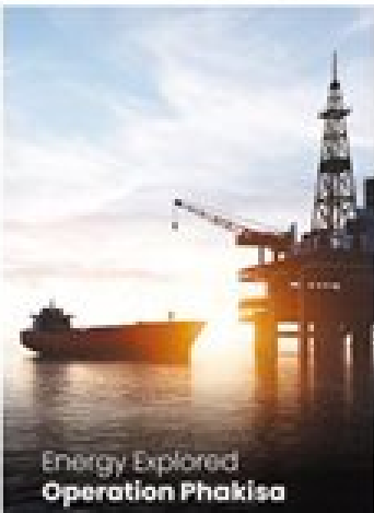
Energy Explored Operation Phakisa