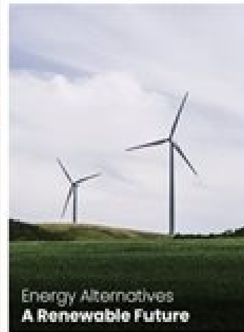
Energy Alternatives A Renewable Future