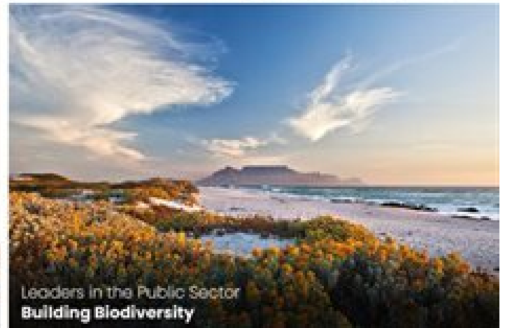
Leaders in the Public Sector Building Biodiversity