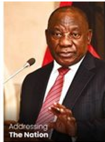
Addressing The Nation