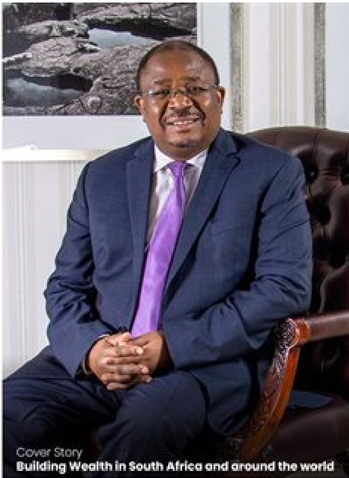
Cover Story Building Wealth in South Africa and around the world