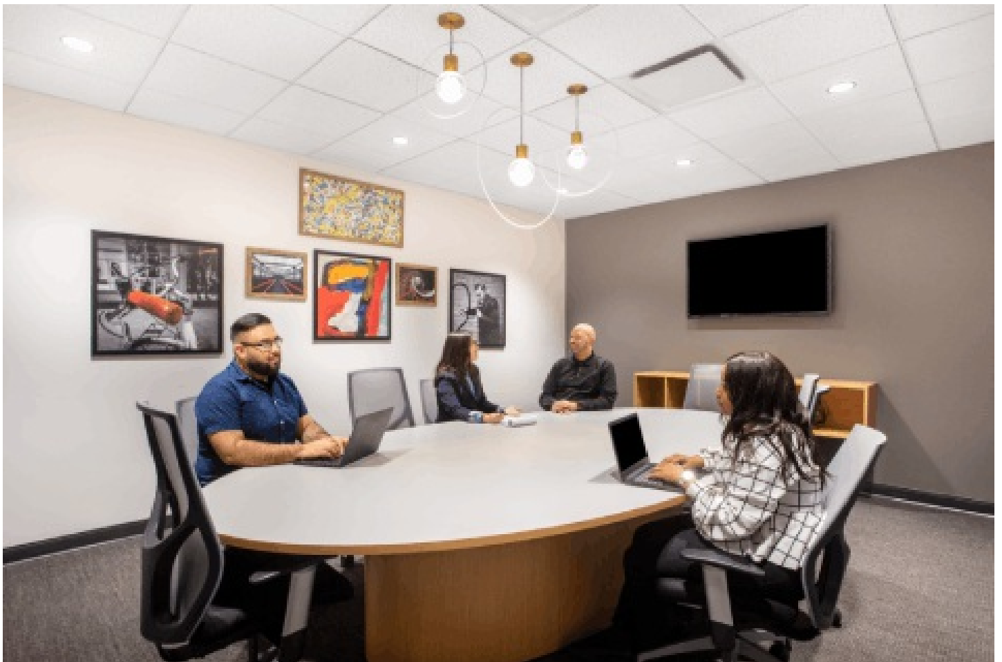
Ahead of the curve