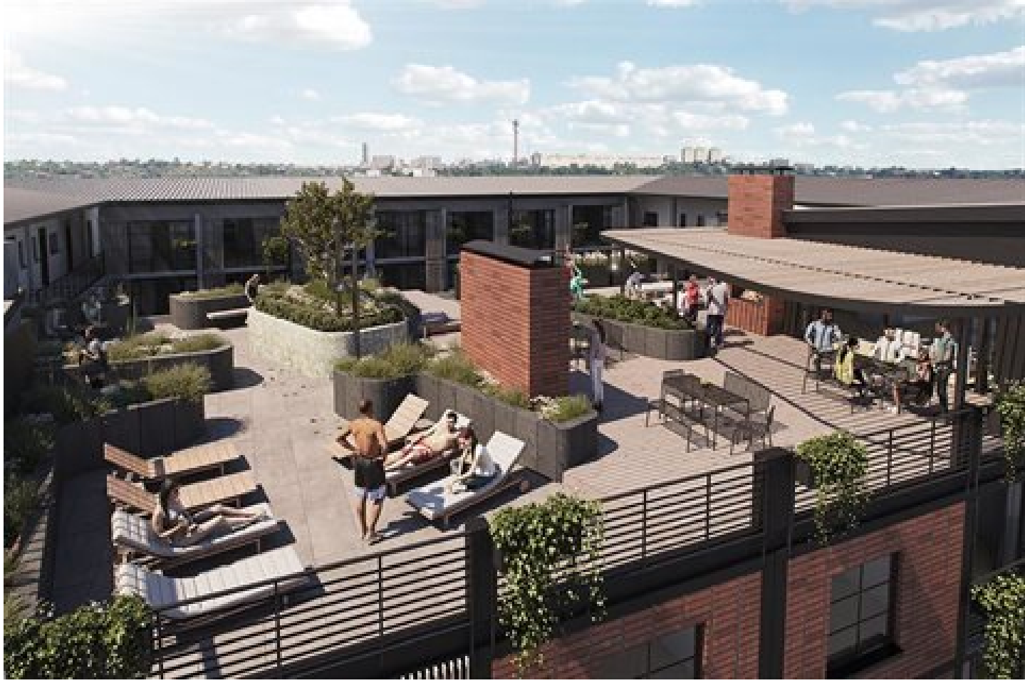
Saxon Square's collection of 134 apartments have all been stylishly designed with high-end, quality industrial chic finishes, effortlessly leveraging functional living – perfect for those seeking an affordable and cosmopolitan lifestyle. Saxon Square's