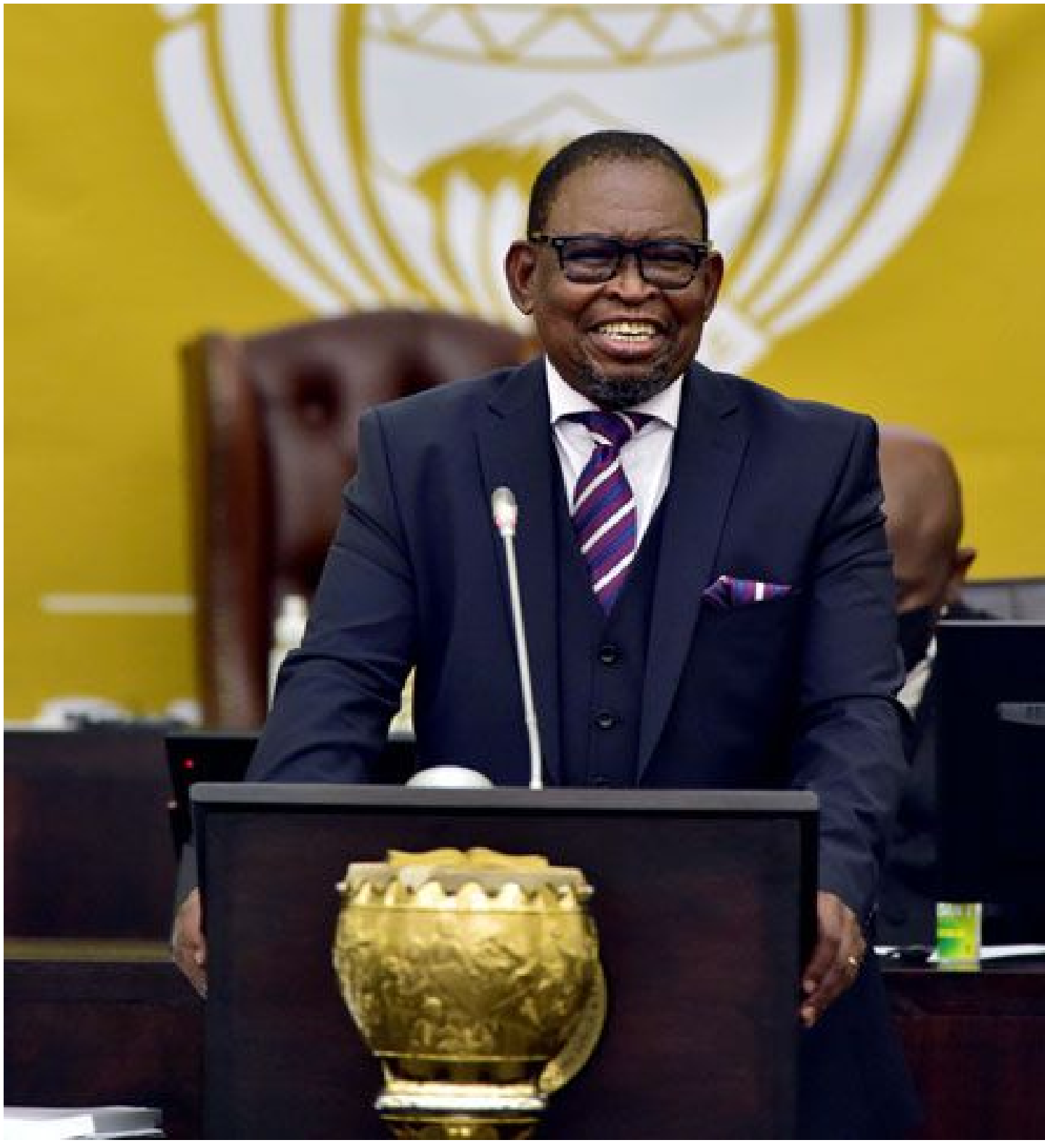
Minister of Finance Enoch Godongwana