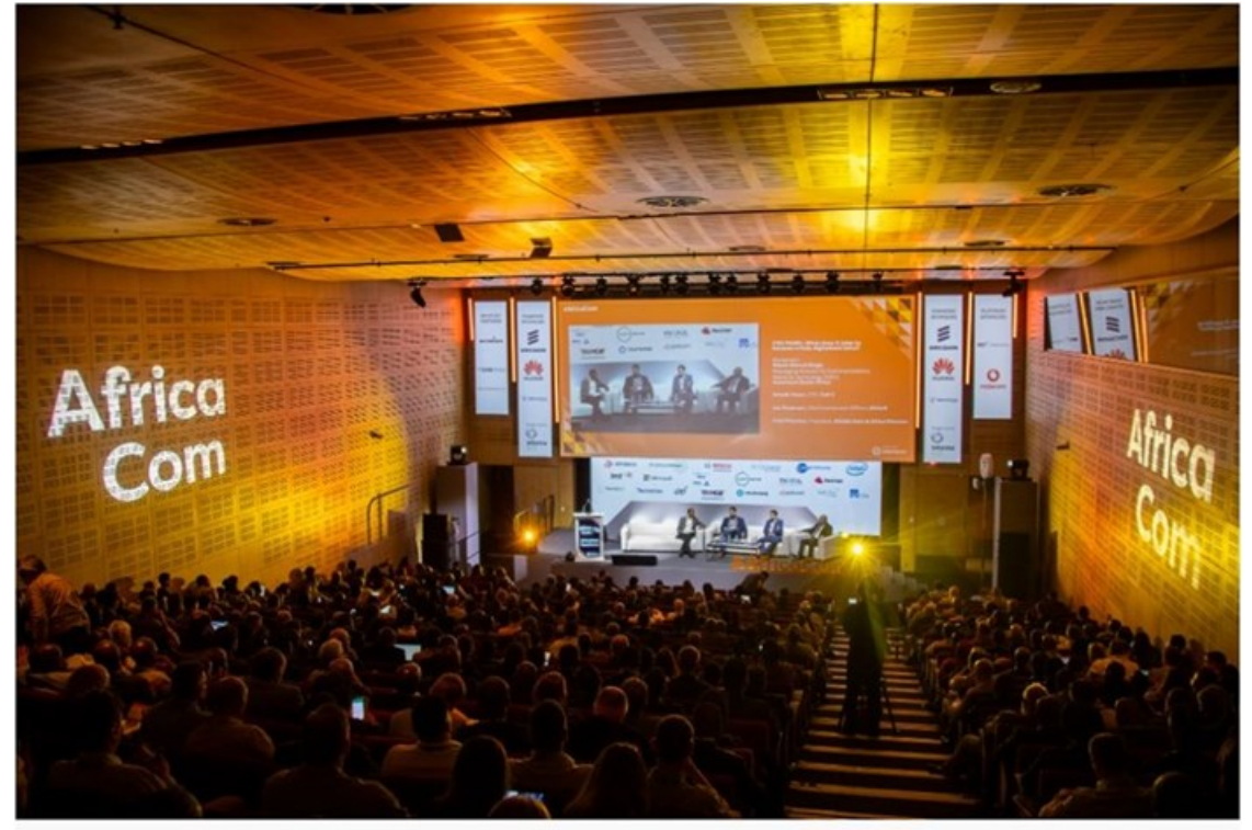
In total, Africa Tech Festival 2022 will host 10.000+ attendees, and 300+ sponsors and exhibitors over a week of strategic events

APO Group, the leading Pan-African communications consultancy and press release distribution service, will award one African journalist transport, accommodation and daily allowance to attend the Africa Tech Festival in Cape Town, South Africa from 7-11 November.