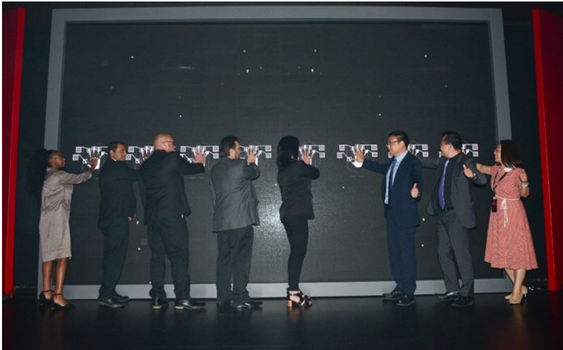
Huawei Commercial Venture official launch

At the launch event held at the Sandton Convention Centre, Huawei outlined the aims and objectives of the new commercial business.