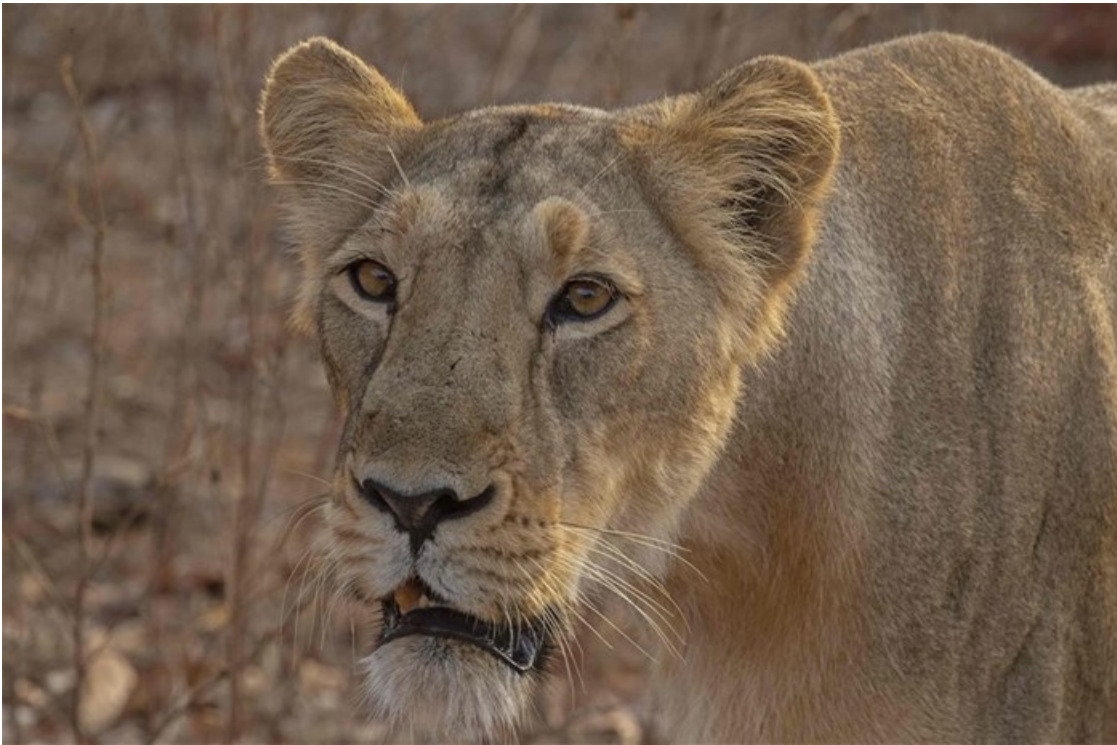
The Lion Pride Next Door