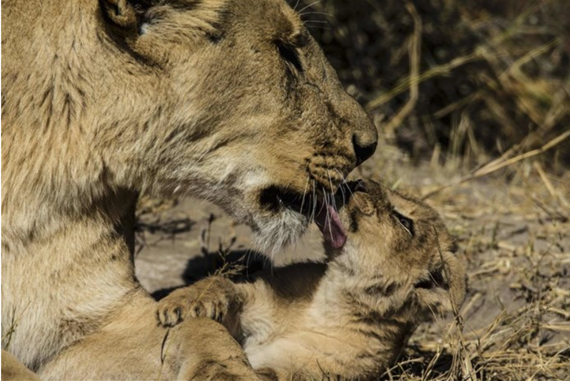
Soul Of The Cat

Lions, tigers, cheetahs, leopards and other big cats roar onto television screens in intriguing specials