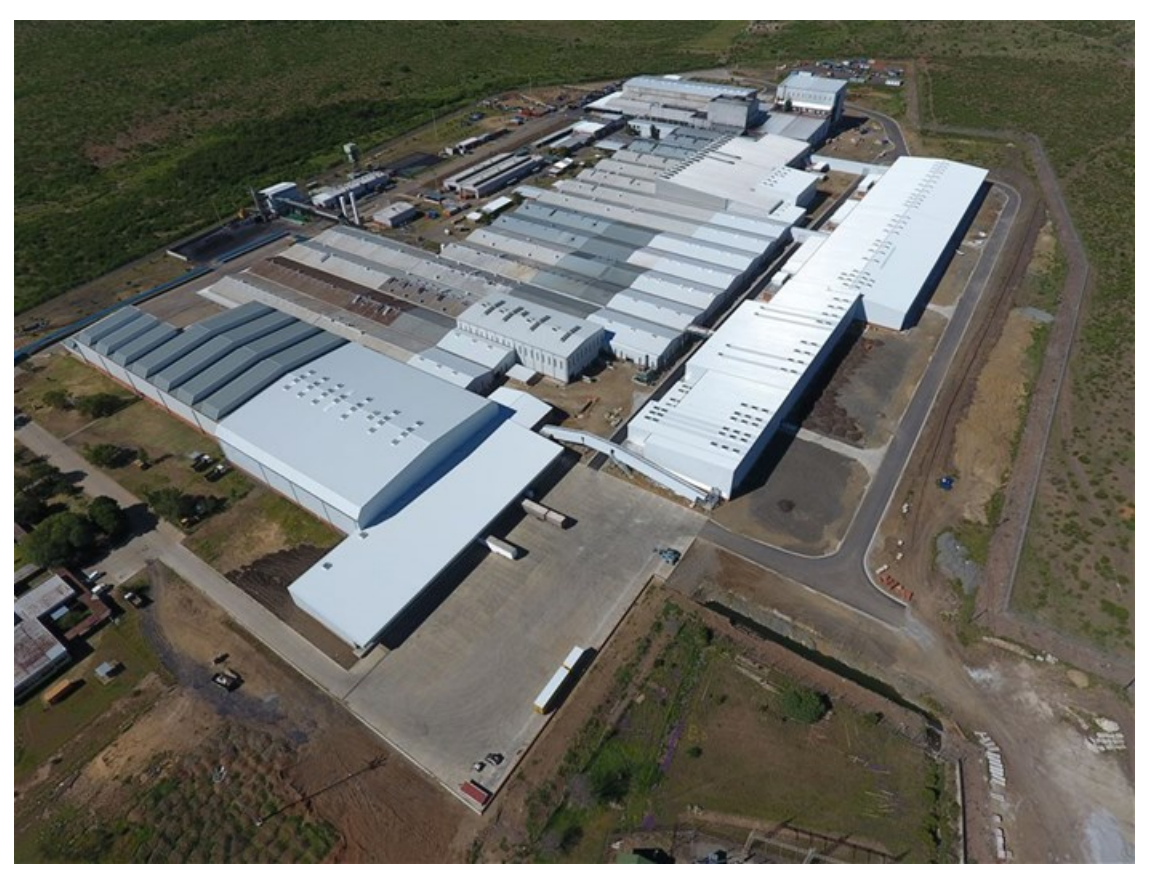
Dunlop Ladysmith production facility

<u>Sumitomo Rubber South Africa</u> (Pty) Ltd (SRSA) is set to inject new life into its <u>Dunlop</u> tyre manufacturing plant in Ladysmith, KwaZulu-Natal, as the production facility marks its golden anniversary this year. The company has lined up a series of exciting investments that will see the plant improve local production capacity, expand product lines and create new job opportunities.