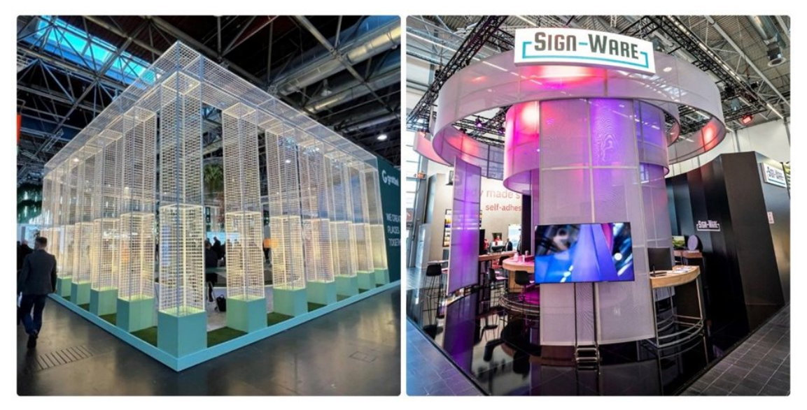
Lighting combined with semi-transparent structures.