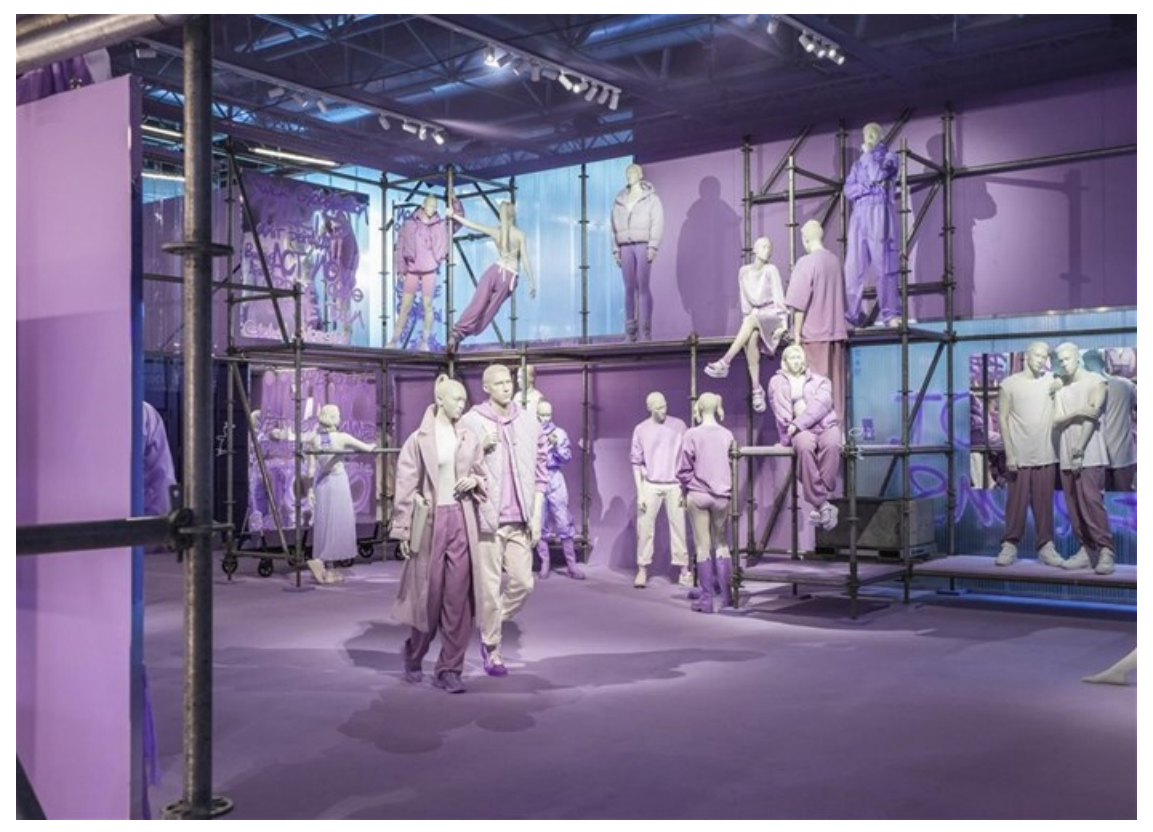
Raw scaffolding and reused painted containers.