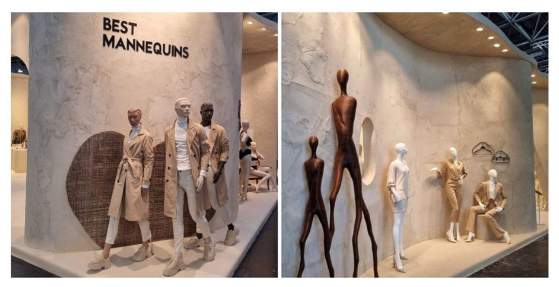
Gever mood lighting casting shadows.

The lighting on the stands was bright (sometimes too bright) and really made a statement. Exhibitors used extensive backlighting, enhancing the bold colours. The backlighting quality was better than ever before, and the graphics really 'popped'. Some exhibitors also used uplighting and mood lighting very effectively.