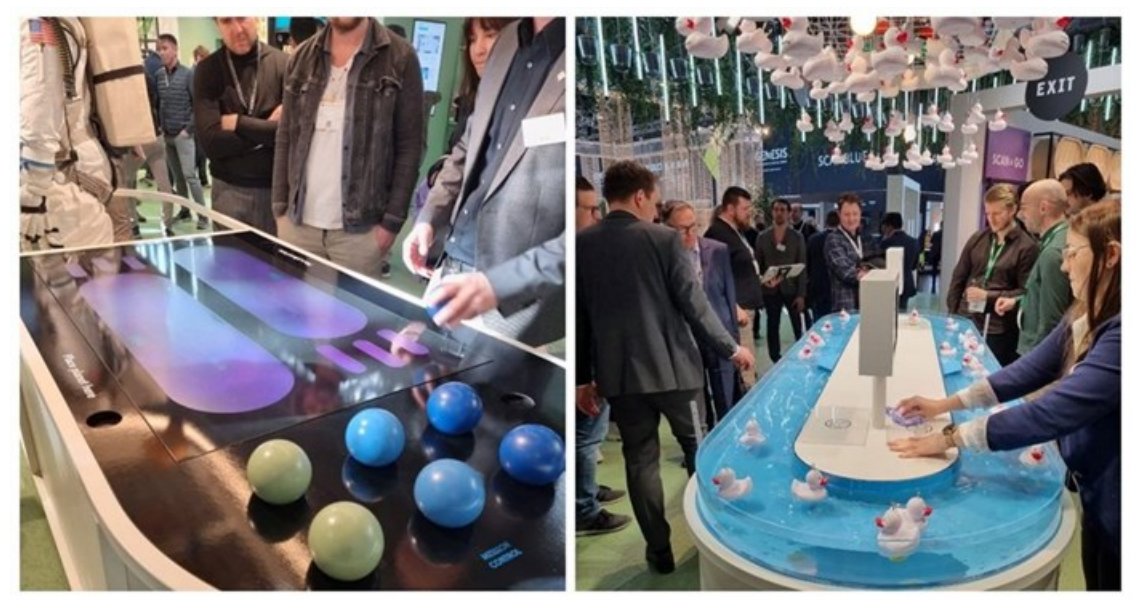
Interactive games on stands.

Interactive elements including games and activities, and the more conventional coffee and snack bars, were used to draw visitors to the stand.