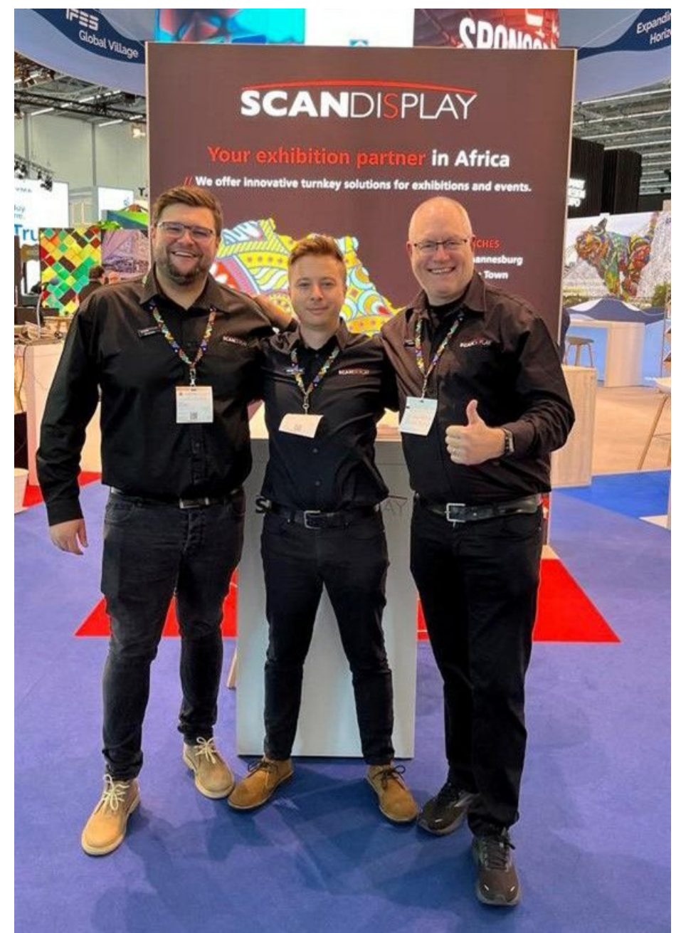
The Scan Display team at EuroShop 2023.