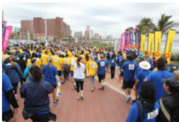
Discovery East Coast Radio Big Walk participants head down the Durban beachfront