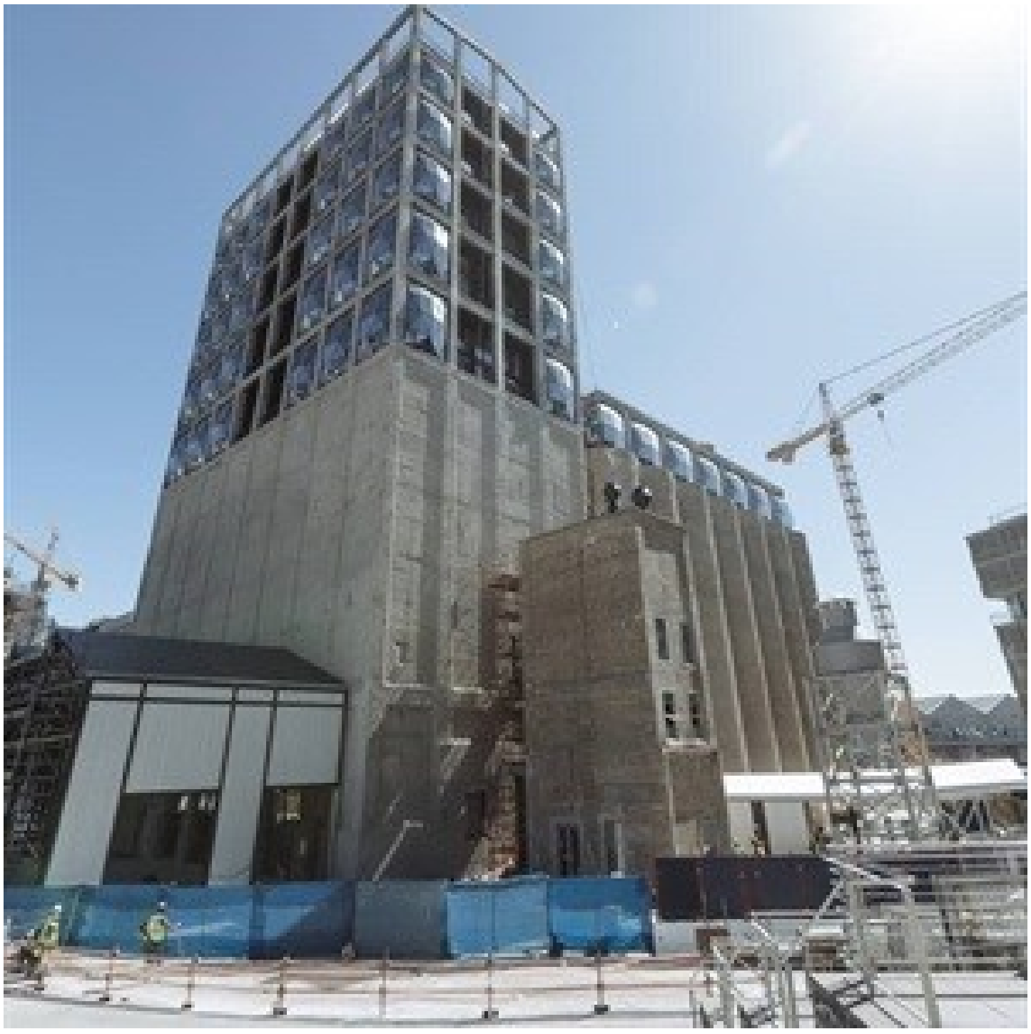
Exterior of the building