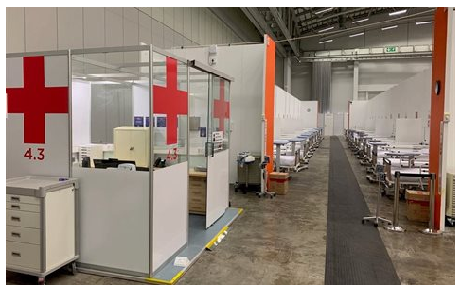
Nurses' station at the Hospital of Hope, Cape Town International Convention Centre (CTICC) <u>click to enlarge</u>