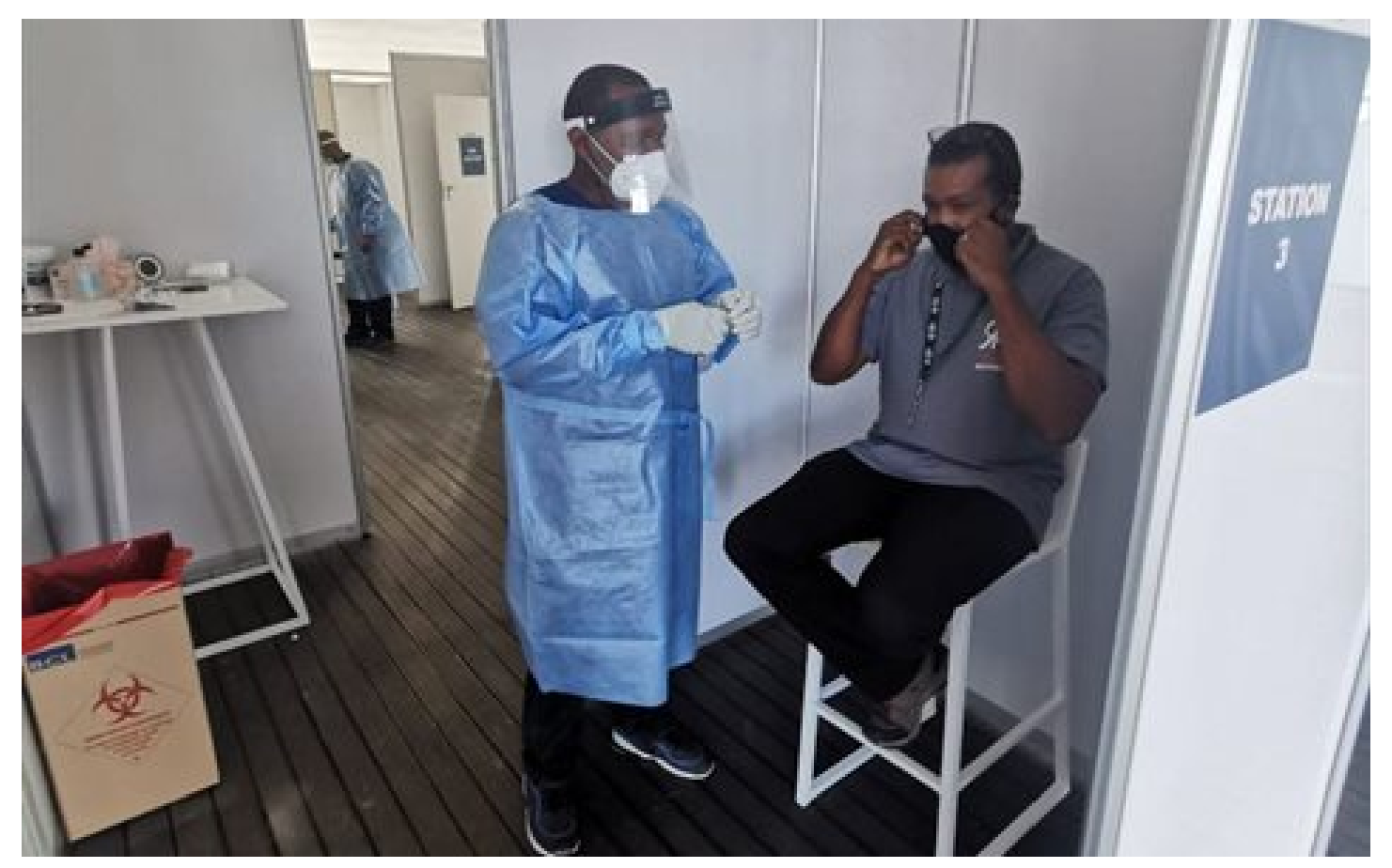
Testing stations at Recharge 2020 at Grand Café & Beach Venue, Cape Town