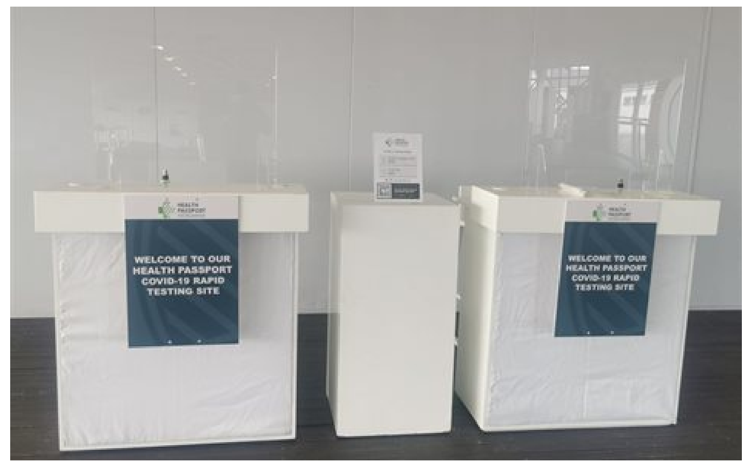
Testing area at Recharge 2020 at Grand Café & Beach Venue, Cape Town