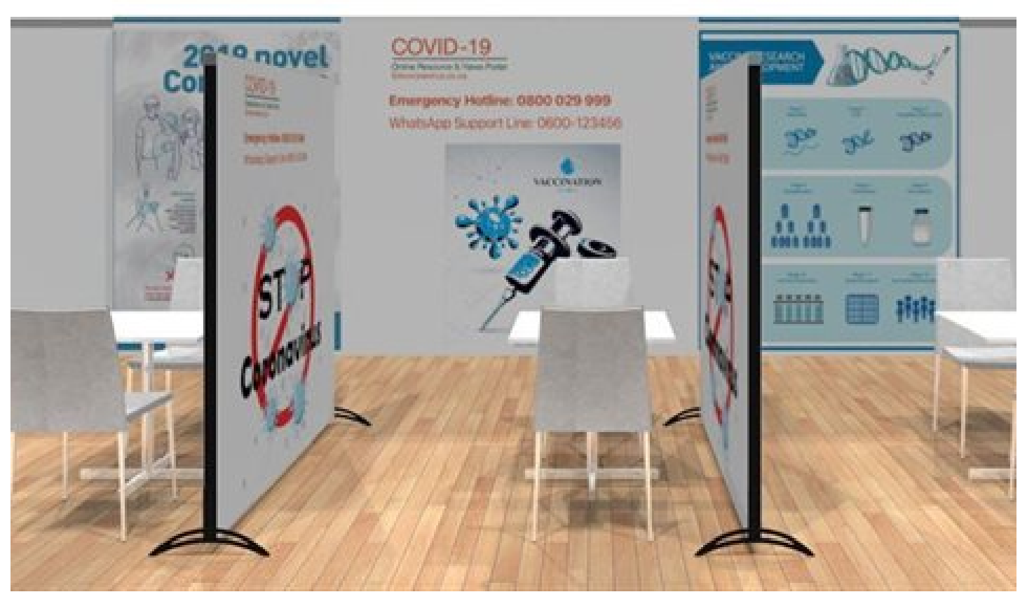
Covid-19 vaccination centre close-up concept