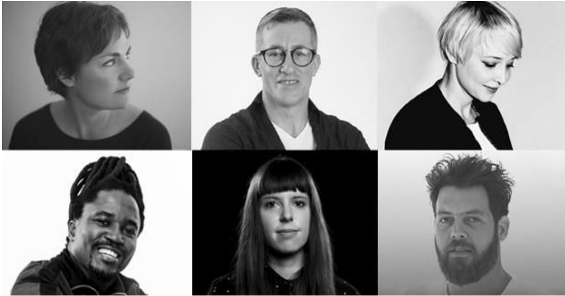
This year's SA Cannes Lions' judges...

Before the Cannes Lions Festival of Creativity for 2019 kicked off last week, I caught up with six of this year's 7 SA judges for their predictions of the creative work that would roar as winners. Let's see who best saw into the future.