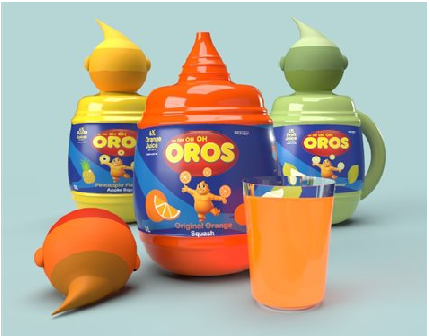
Malaika Mukelwa Fraser's Oros bottles