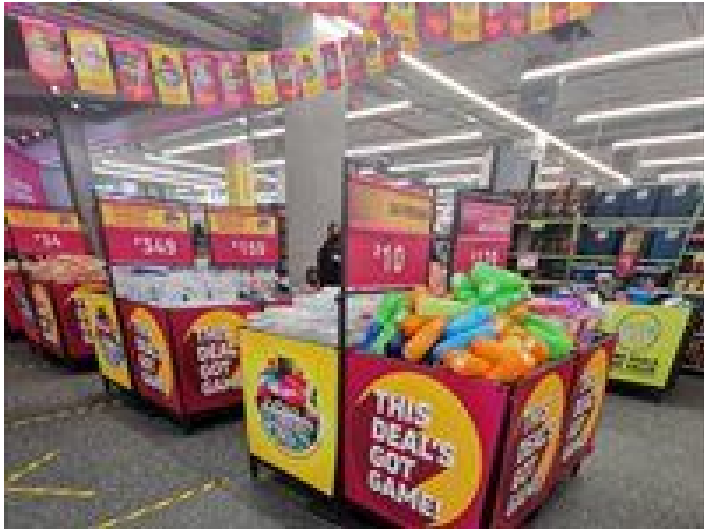
Game - Visual merchandising, signage 1