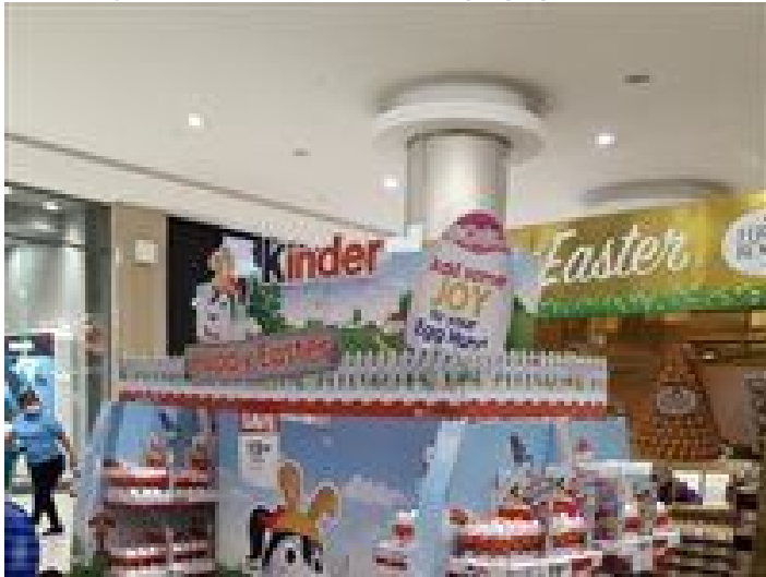
Sandton City - Decorations, visual merchandising, signage 4