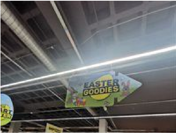
Pick n Pay - Signage