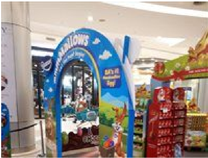
Sandton City - Decorations, visual merchandising, signage 3