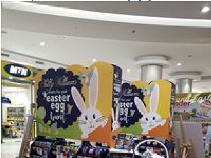
Sandton City - Decorations, visual merchandising, signage 5