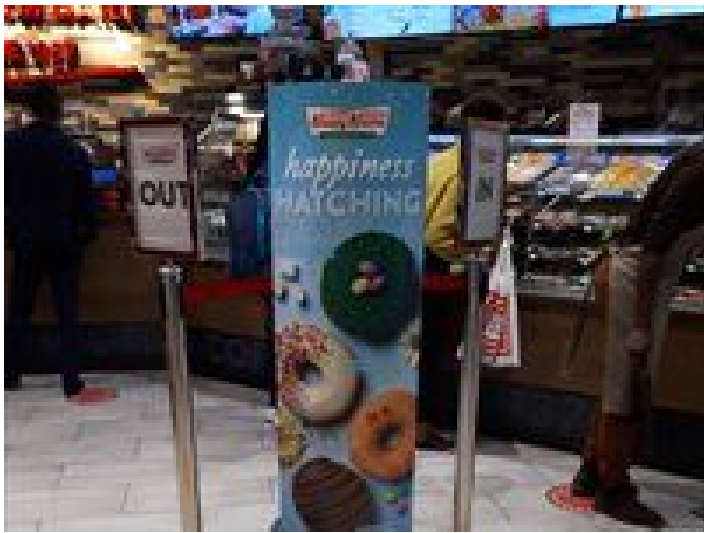
Krispy Kreme - Signage 1