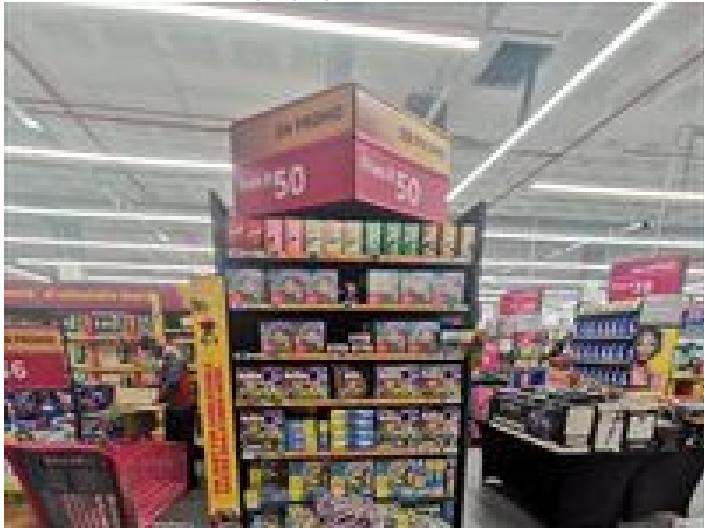
Game - Visual merchandising, signage 2