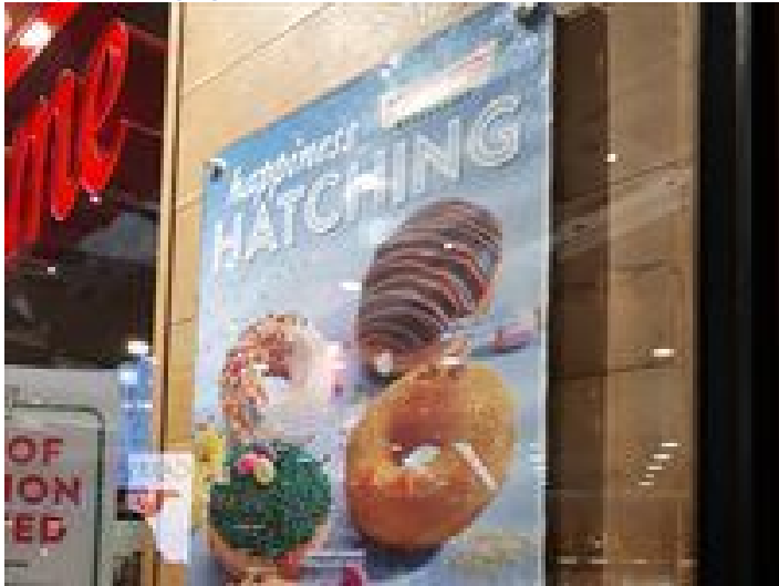
Krispy Kreme - Signage 2